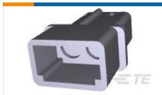
TE Part #794012-1 02P CMNL CAP HSG W/POS LOCK