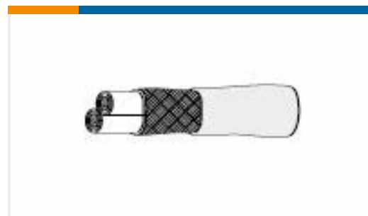
TE Part #563965-000 55A1111-18-9-9CS2275