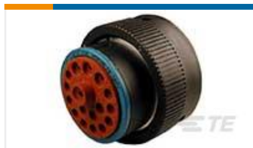
TE Part #HDP26-24-18PE PLG, 18P, BLK, E, 8/12/16, P