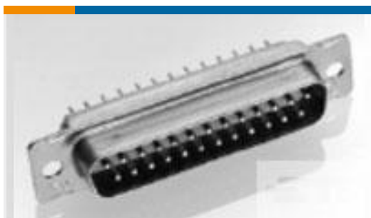
TE Part #204506-1 RECEPT ASSY,62 POSN,AMPLIMITE