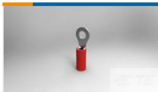
TE Part #2-36149-2 PIDG R 22-16 COM 22-18 MIL 6