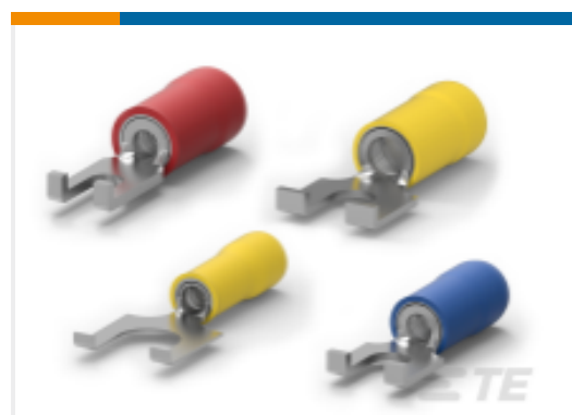
TE Part #326865 PIDG FLANGED SPADE TONGUE TERMINALS