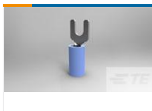
TE Part #2-35559-1 TERMINAL, PIDG SPD 16-14 6