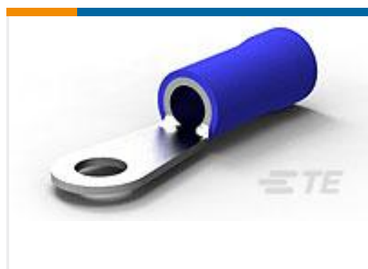
TE Part #52042-7 TERMINAL R PG 6 1/4