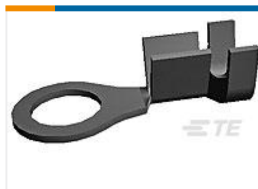
TE Part #60700-2 RING CRIMP 20-16 AWG TPBR