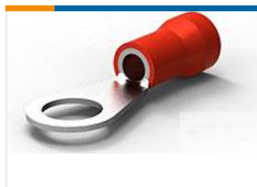
TE Part #52291-5 TERMINAL R PG 8 3/8