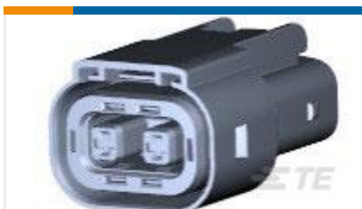
TE Part #1587902-2 Plug Pig Tail Assy, HV, HVA280 2P