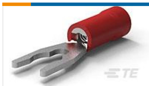
TE Part #53241-2 PG SPR SPD 22-16COMM 22-18MIL8