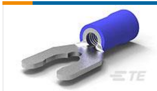
TE Part #52957-1 TERMINAL,PG SPR SPD 16-14 10