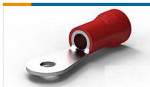
TE Part #52041-9 TERMINAL R PG 8 1/4