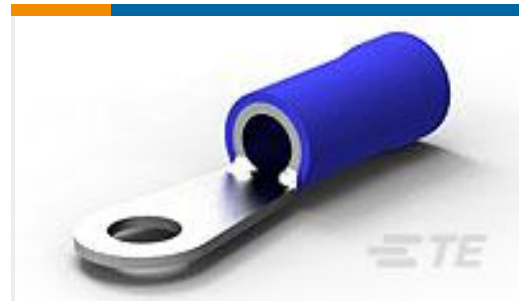
TE Part #52042-9 TERMINAL R PG 6 1/4