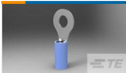
TE Part #2-34806-2 PIDG 16-14HD R 1/4; TAPE