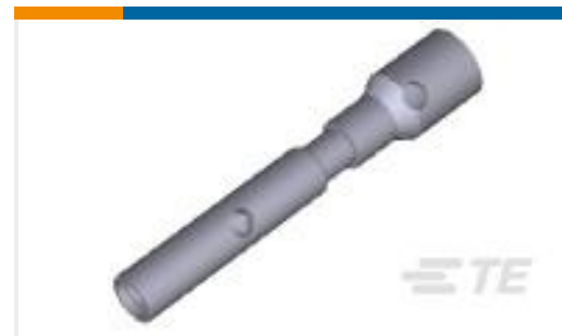
TE Part #193797-1 SKT ASSY - 2MM, 10 AWG