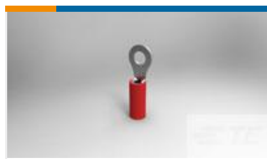
TE Part #7-51863-1 PIDG R 22-16 COMM 22-18 MIL 6