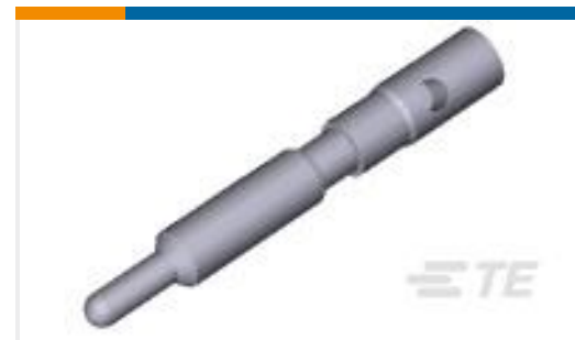
TE Part #193841-1 PIN, 2MM, 12-14 AWG