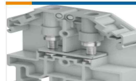
TE Part #1SNA510003R0000 RGW2.5-V0