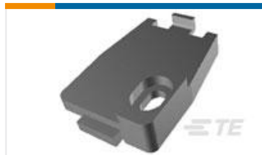
TE Part #640713-1 02P UMNLI STR/REL & INSERT