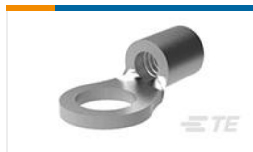
TE Part #322447 TERMINAL,SOLIS R 12-10 4