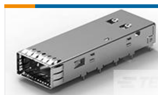
TE Part #2110487-1 QSFP Cage, Solder Leg, No HS Opening