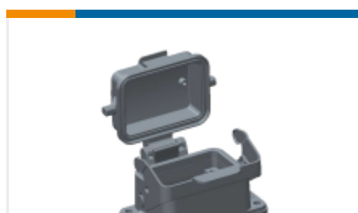
TE Part #T1510063000-000 H6B-AD