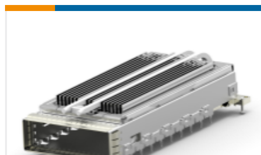
TE Part #2314979-1 HARD WARE KITS WITH HS&LP, CFP2 1X1