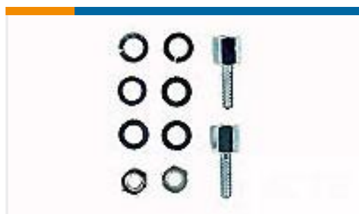
TE Part #178877-1 SCREWLOCK WITH SPRING WASHER