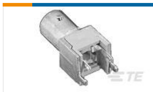
TE Part #6274314-1 BNC JACK VERTICAL SWITCHING, PCB