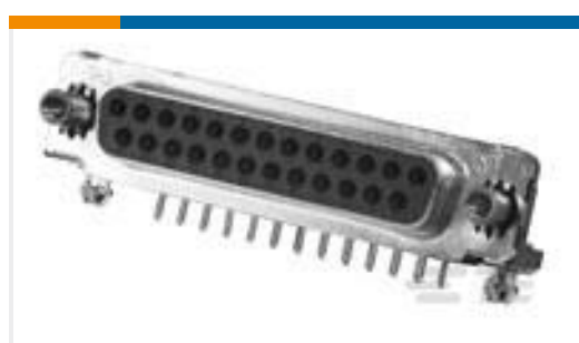
TE Part #5745784-6 37 MSFL RCPT RA 318 (SL,FM)