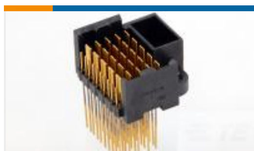
TE Part #5120658-1 Z-PACK HS3 HDR ASY 10R 100P