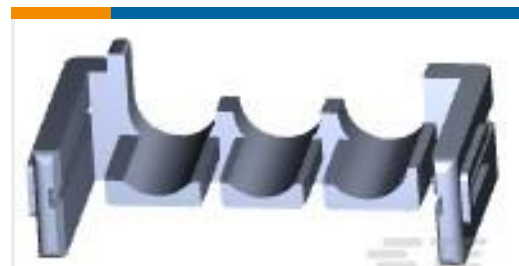
TE Part #177919-1 POWER DBL LOCK PLATE 3P