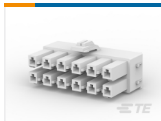
TE Part # 917354-1 AMP POWER D/LOCK PLUG HDR 12P