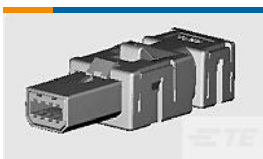
TE Part #2040008-2 INDUSTRIAL MINI I/O PLUG KIT D2-WHITE L