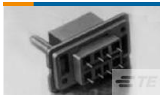
TE Part #5172625-3 DRAWER CONN. FEMALE ASSY 24P