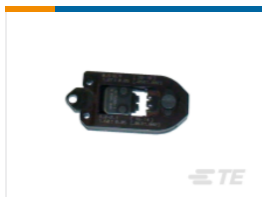
TE Part # 91569-3 CCII POWER DBL LOCK L REC TAB 20-16 HEAD