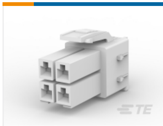
TE Part #177905-1 STD Temp Power Double Lock Plug