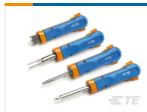
TE Part # 234912-1 EXT TOOL FOR POWER DBL LOK REC