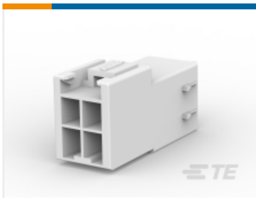
TE Part #177909-1 STD Temp Power Double Lock Cap