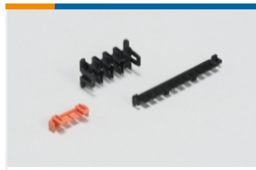
Rectangular Connector Locking(14)