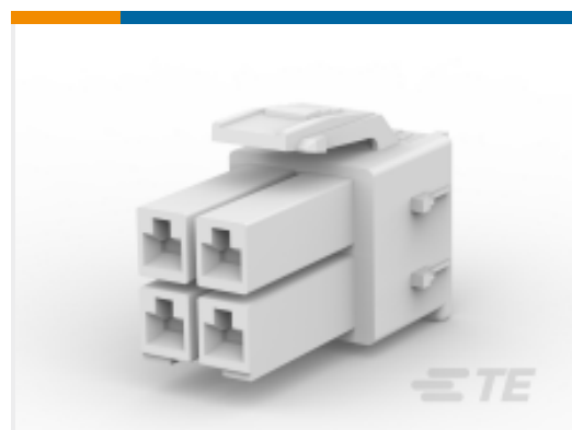
TE Part # CAT-P87024-P729 STD Temp Power Double Lock Plug