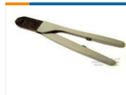
TE Part # 91569-1 CCII POWER DBL LOCK L REC TAB 20-16 ASSY