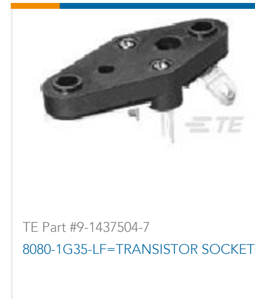
TE Part #9-1437504-7 8080-1G35-LF=TRANSISTOR SOCKET BLACK