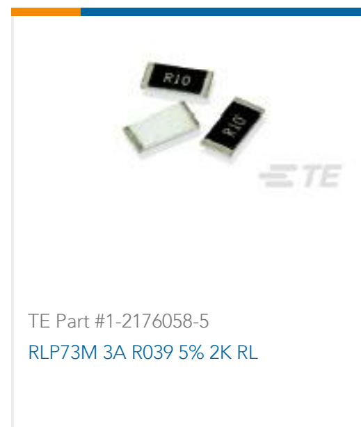
TE Part #1-2176058-5 RLP73M 3A R039 5% 2K RL