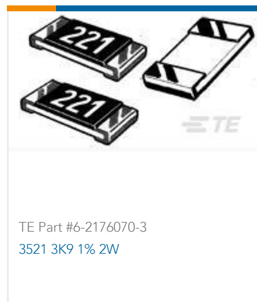
TE Part #6-2176070-3 3521 3K9 1% 2W