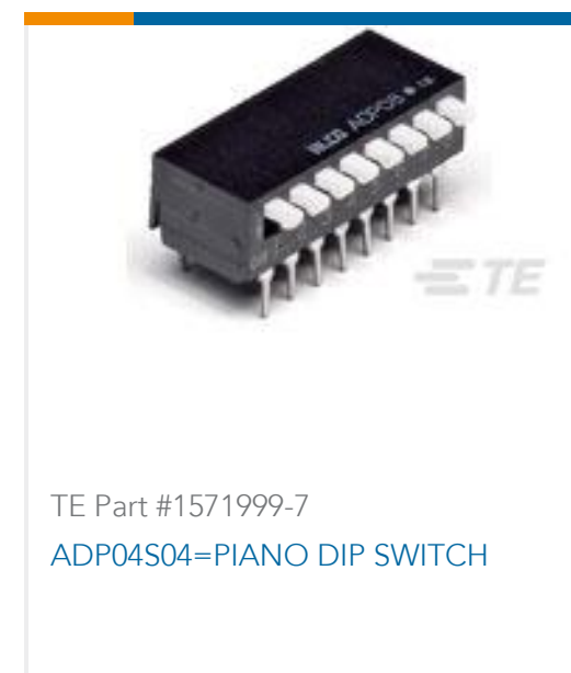
TE Part #1571999-7 ADP04S04=PIANO DIP SWITCH