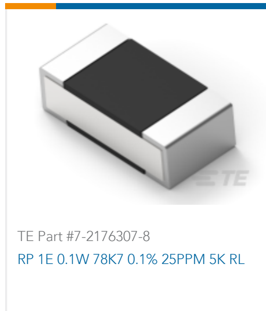
TE Part #7-2176307-8 RP 1E 0.1W 78K7 0.1% 25PPM 5K RL