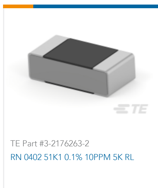
TE Part #3-2176263-2 RN 0402 51K1 0.1% 10PPM 5K RL