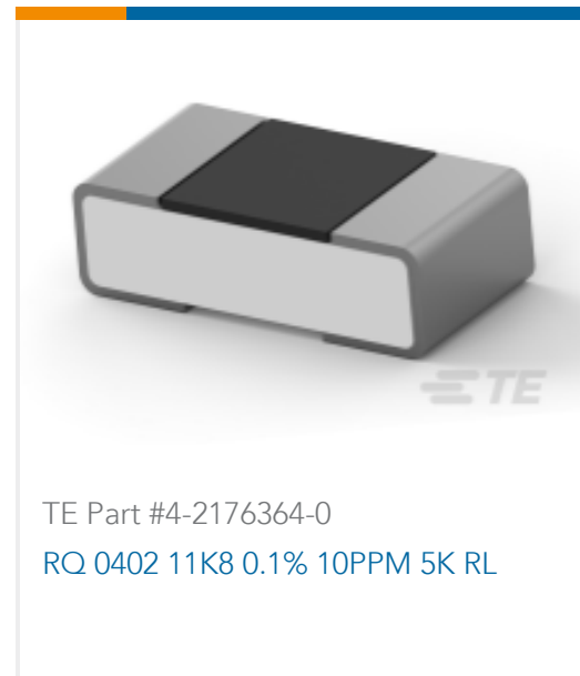
TE Part #4-2176364-0 RQ 0402 11K8 0.1% 10PPM 5K RL