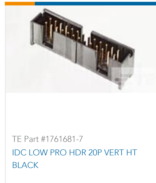
TE Part #1761681-7 IDC LOW PRO HDR 20P VERT HT BLACK