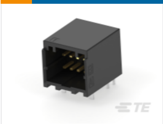
TE Part #1-1827872-3 Header Assembly: Wire-to-Board, 3A, gold or Tin plated