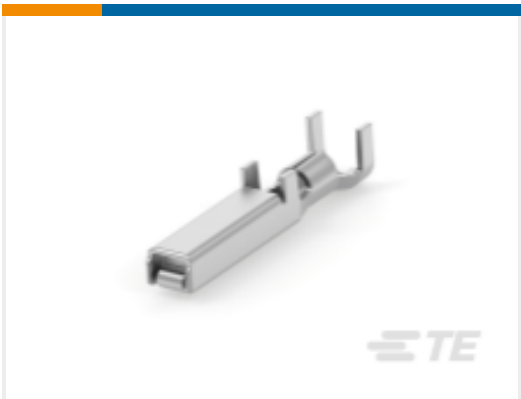
TE Part #175288-3 Contact: Component To Wire; 15A, 28-14 wire size