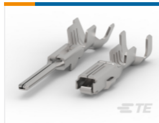
TE Part #183035-1 AMP SUPERSEAL 1.5MM, RECEPTACLE AND TAB