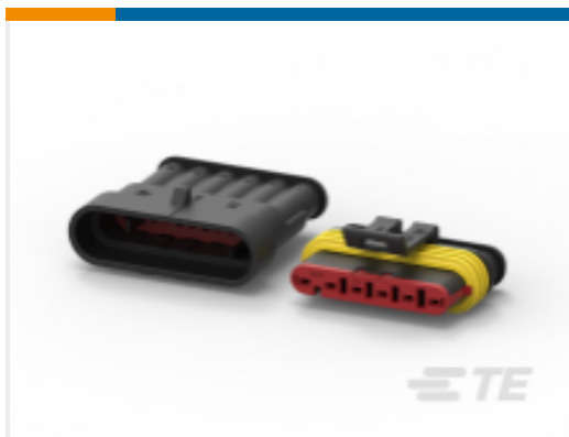
TE Part #282108-1 AMP SUPERSEAL 1.5MM, CONNECTOR HOUSING