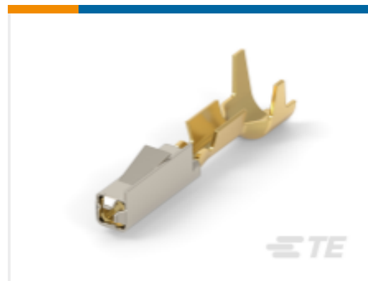
TE Part #5-963727-5 MOS SOCKET CONTACT SWS