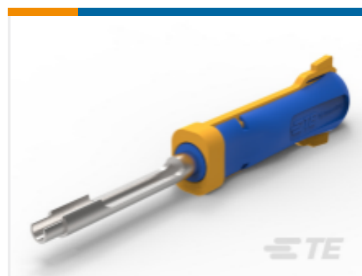
TE Part # 1-1579008-0 EXTRACTION TOOL TO OPEN SECONDARY LOCK