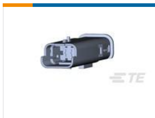
TE Part # 1801177-1 3W TAB CONNECTOR HP BLACK