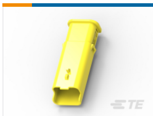
TE Part # 1801177-4 3W TAB CONNECTOR HP YELLOW