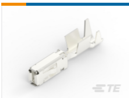
TE Part # CAT-AM706-T273 AMP MCP, SFC, RECEPTACLE