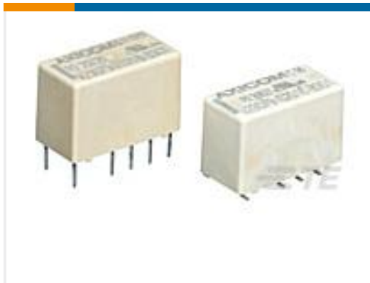
TE Part #6-1393788-1 V23079D1008B301