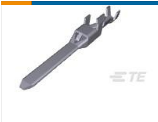
TE Part #175287-3 DYNAMIC D-3 TAB CONT. S AU 0.76 L /P