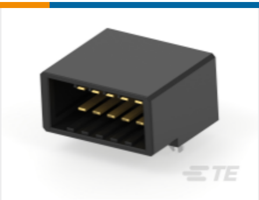
TE Part #178323-3 Header Assembly: Wire-to-Board, 15A, gold or tin plated