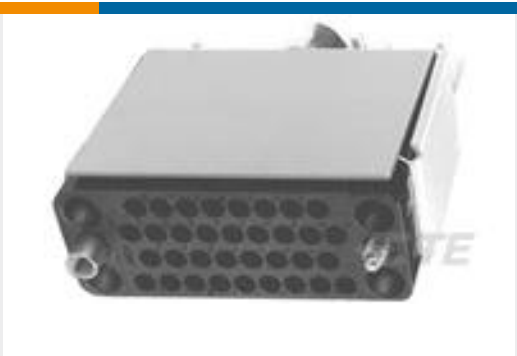
TE Part #213931-1 M-SRS KIT,V.35,34P,BULK PKG