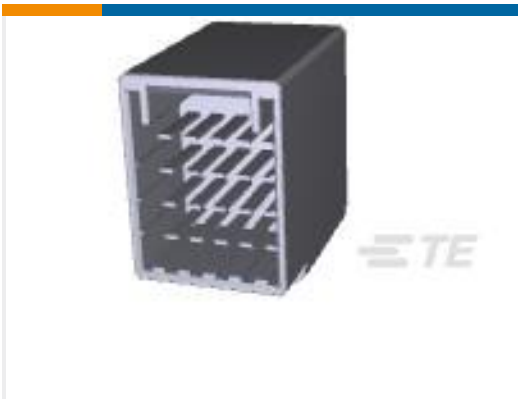
TE Part #917251-3 DYNAMIC D-3400F HDR ASSY 20P H