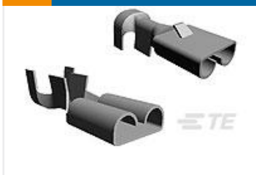
TE Part #170096-2 250 FASTON,REC.,22-18 AWG,TPPB