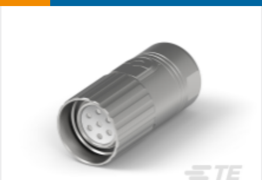
TE Part #ASA158F12390235000 623 PLUG