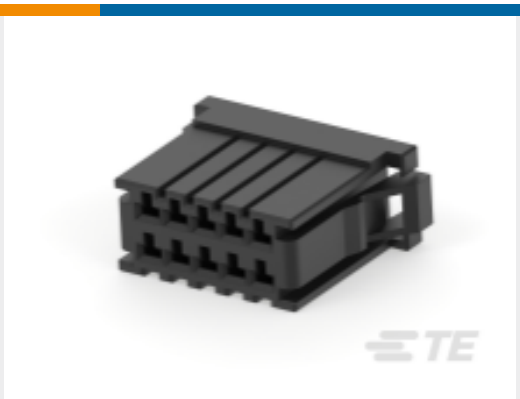
TE Part #178803-5 Receptacle and Tab Housing: 3.81 mm pitch, 250V