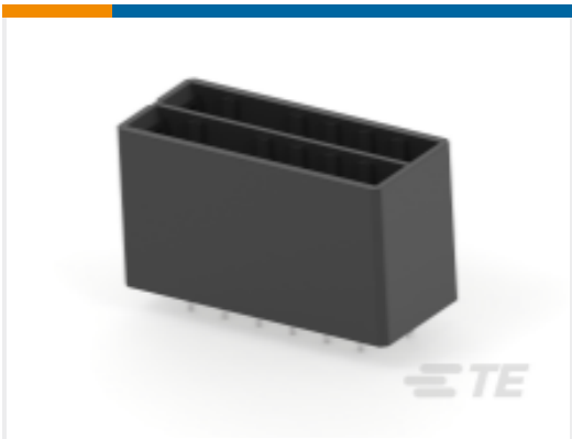
TE Part #2-316132-3 Header Assembly: Wire-to-Board, 15A, gold or tin plated