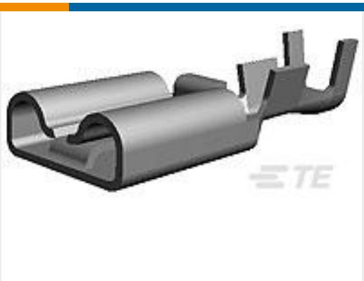
TE Part #175023-1 PL 250 RECEPTACLE 18-14 AWG PTBR