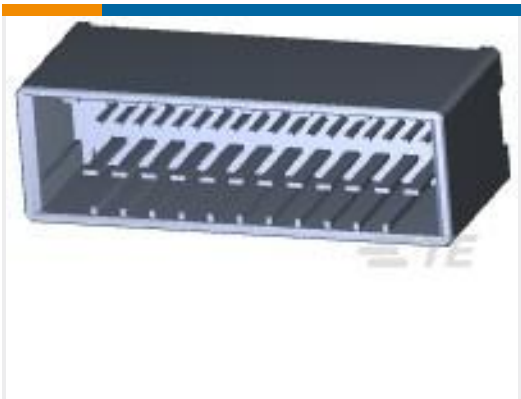
TE Part #1827538-1 DYNAMIC D-2600 HYBRID V-HDR ASSY 48P