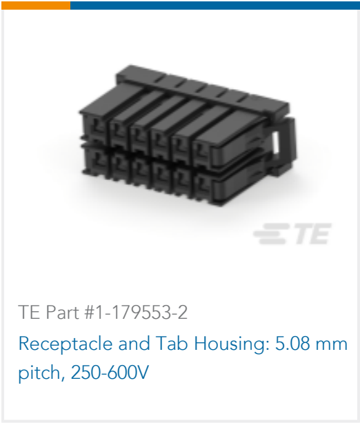
TE Part #1-179553-2 Receptacle and Tab Housing: 5.08 mm pitch, 250-600V