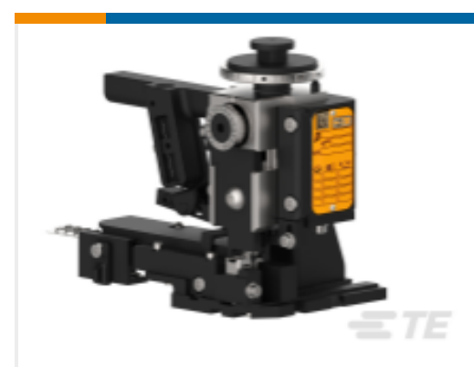
TE Part # 2151124-1 OCEAN-2.0-APPLICATOR-S-062F120F