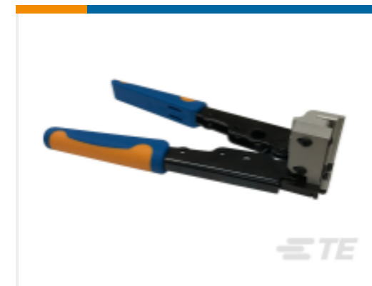
TE Part # 2305570-1 TERMINAL CUTTER, SIDE FEED