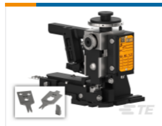
TE Part # 7-2151124-1 OCEAN-2.0-APPLICATOR-S-062F120F