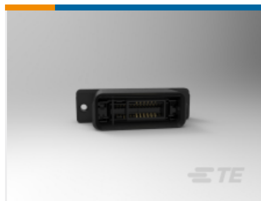
TE Part # 2-292181-8 PLUG ASS'Y OF HYB DRAWER 32P