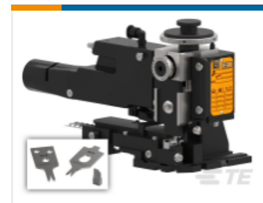
TE Part # 7-2151124-2 OCEAN-2.0-APPLICATOR-S-062F120F