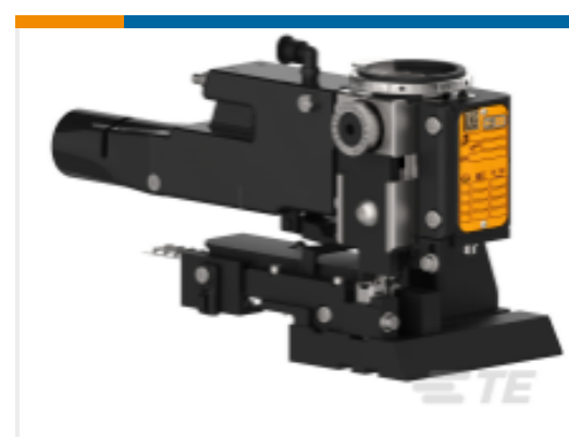
TE Part # 2-2151124-2 OCEAN-2.0-APPLICATOR-S-062F120F