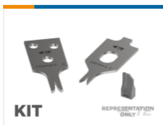
TE Part # 7-2151124-7 OC-062F120F-CRIMP TOOLING KIT