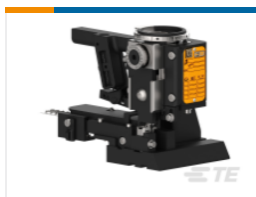
TE Part # 2-2151124-1 OCEAN-2.0-APPLICATOR-S-062F120F