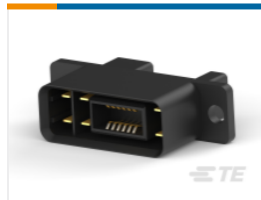
TE Part # 1-292183-2 PLUG ASS'Y OF HYB DRAWER 18P