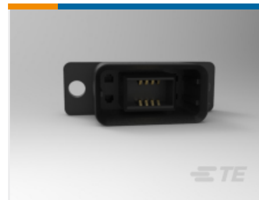
TE Part # 292182-8 PLUG ASS'Y OF HYB DRAWER 12P