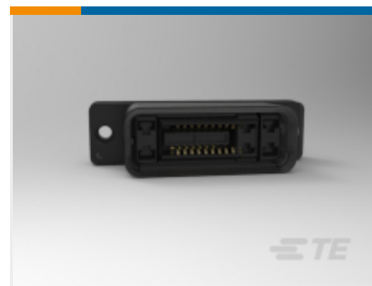
TE Part # 2-292181-0 PLUG ASS'Y OF HYB DRAWER 24P