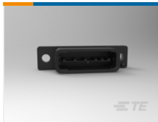
TE Part # CAT-AM7053-D797P Mini CT Drawer Connector Assemblies