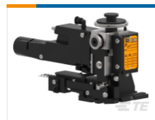
TE Part # 2151124-2 OCEAN-2.0-APPLICATOR-S-062F120F