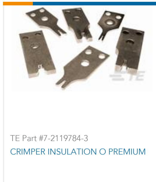
TE Part #7-2119784-3 CRIMPER INSULATION O PREMIUM