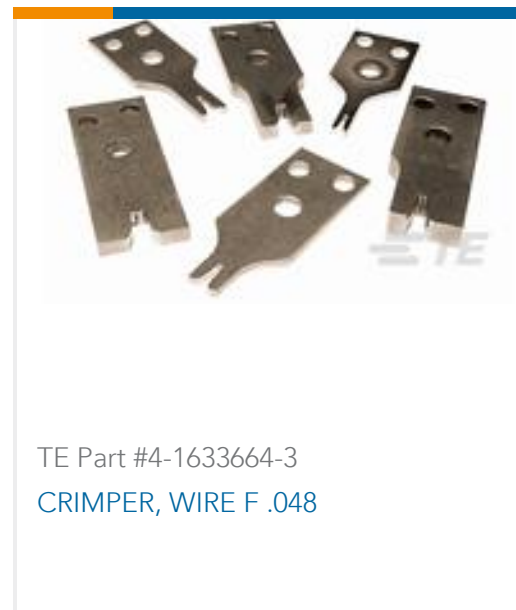
TE Part #4-1633664-3 CRIMPER, WIRE F .048