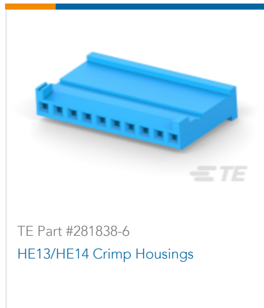
TE Part #281838-6 HE13/HE14 Crimp Housings