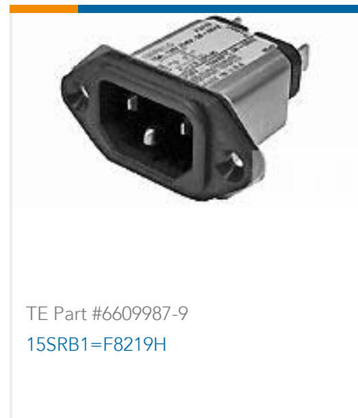
TE Part #6609987-9 15SRB1=F8219H