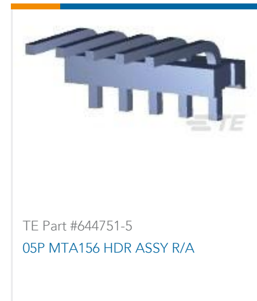
TE Part #644751-5 05P MTA156 HDR ASSY R/A