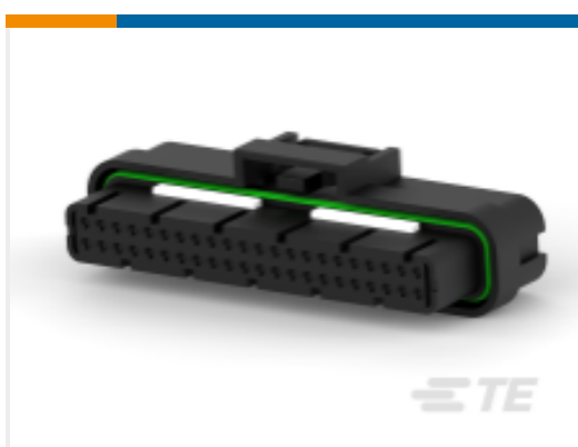
TE Part #2-1447232-6 3900281-441=SP/SEAL 44P PLUG