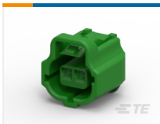
TE Part #2822362-4 070 EJ MK-2 SENSOR PLUG 2P DARK GREEN