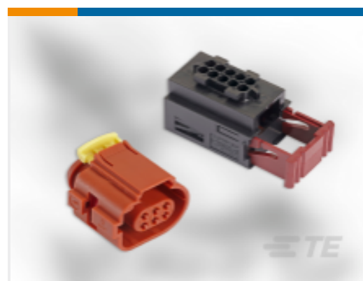
TE Part #493576-1 TIMER, CONNECTOR HOUSING