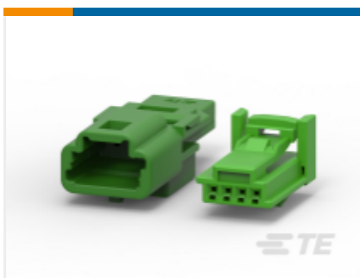
TE Part #1123341-1 TH/.025 CONNECTOR SYSTEM, HOUSING