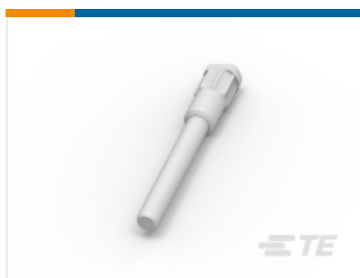
TE Part #1981561-2 0.50 SERIES CAVITY PLUG