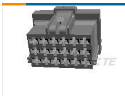
TE Part #6-968974-1 MCP2.8 HSG ASSY 18P