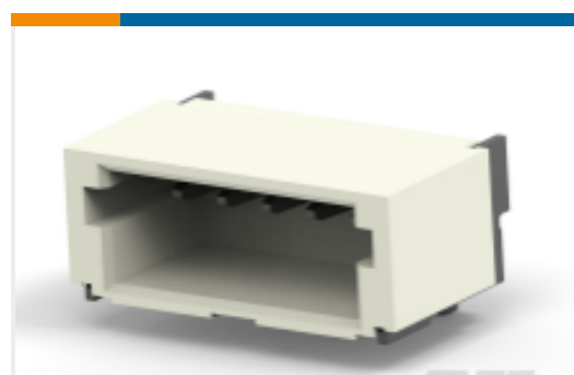
TE Part #1-1734595-0 AMP HPI 1.0MM HEADERS