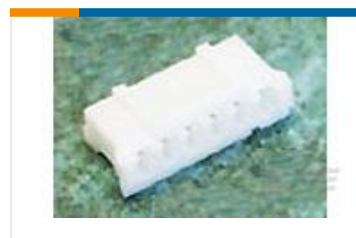
TE Part #1-1775441-5 EMIX CONN., 1.5MM PITCH, RCPT, HSG, 15P