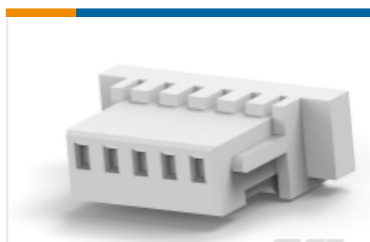
TE Part #1470364-6 AMP HPI 1.0MM RECEPTACLE HOUSINGS