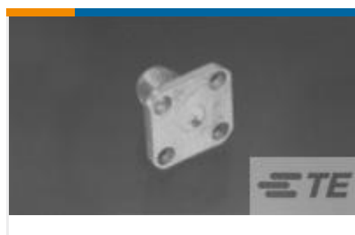
TE Part #1052604-1 2052 3123 00