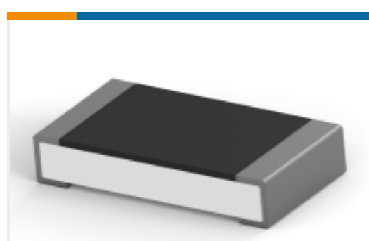
TE Part #1-2176392-4 RQ 1206 182K 0.1% 10PPM 5K RL