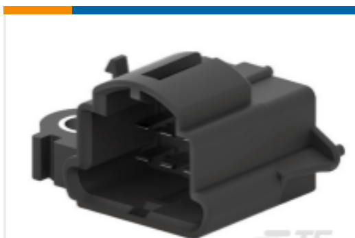
TE Part #173856-1 LOW & MEDIUM POWER HEADER