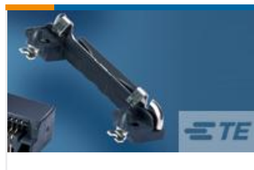
TE Part #1717832-2 MINI PCI EXPRESS EMBOSS TAPE LATCH