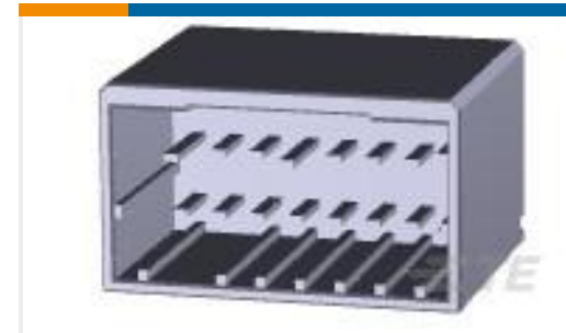
TE Part #1747994-1 DYNAMIC D-2100 V-HDR ASS'Y 16P X- KEY