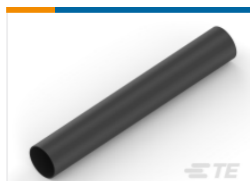
TE Part #NB16934001 VERSAFIT-3/64-0-SP