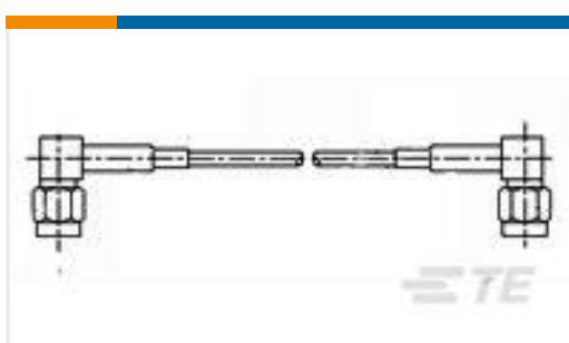
TE Part #1337812-1 50 OHM COAX SMA ELB PLUG ELB P