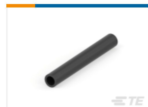
TE Part #NB16544001 RW-175-3/32-0-SP