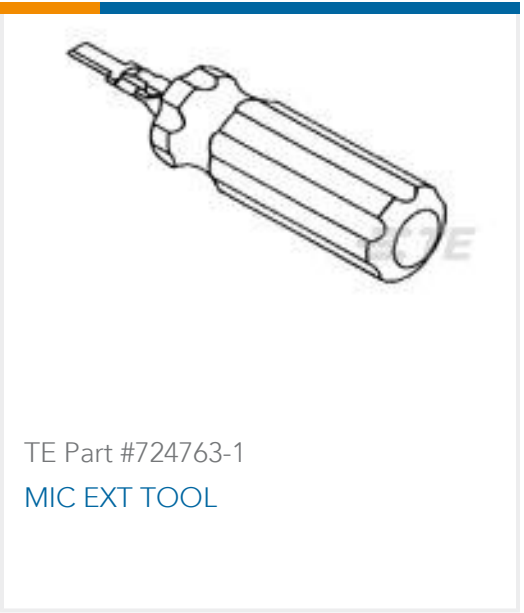
TE Part #724763-1 MIC EXT TOOL