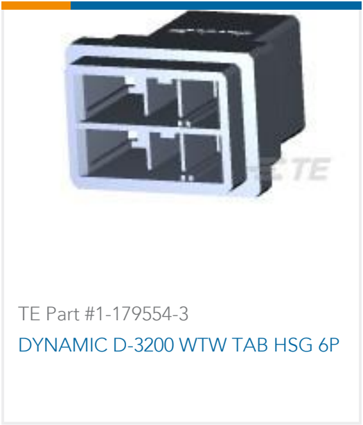
TE Part #1-179554-3 DYNAMIC D-3200 WTW TAB HSG 6P