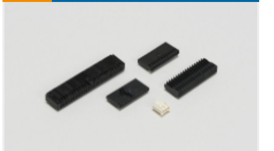
Wire-to-Board Connector Assemblies & Housings(152)