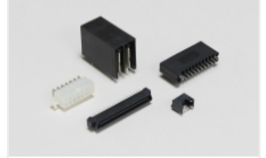
Standard Rectangular Connectors(2)