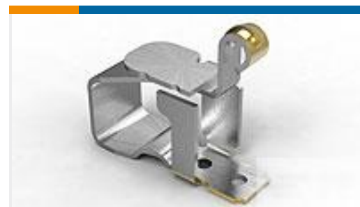
TE Part #1551575-5 Shield Finger, Loose Piece