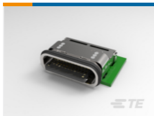
TE Part # 2305018-2 USB TYPE C, REC IPX8 ON BOARD DUAL SMT