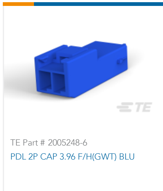
TE Part # 2005248-6 PDL 2P CAP 3.96 F/H(GWT) BLU