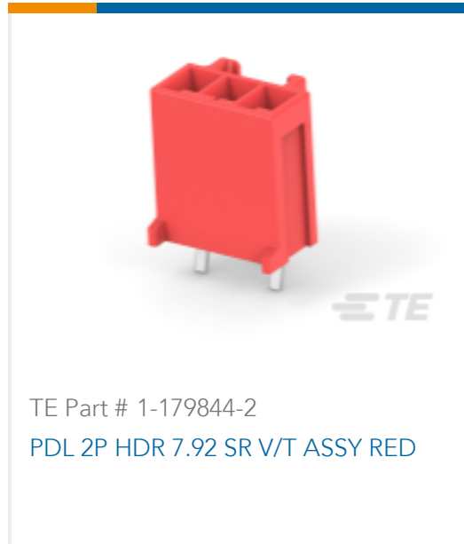
TE Part # 1-179844-2 PDL 2P HDR 7.92 SR V/T ASSY RED