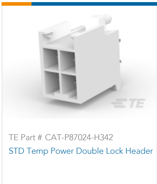
TE Part # CAT-P87024-H342 STD Temp Power Double Lock Header