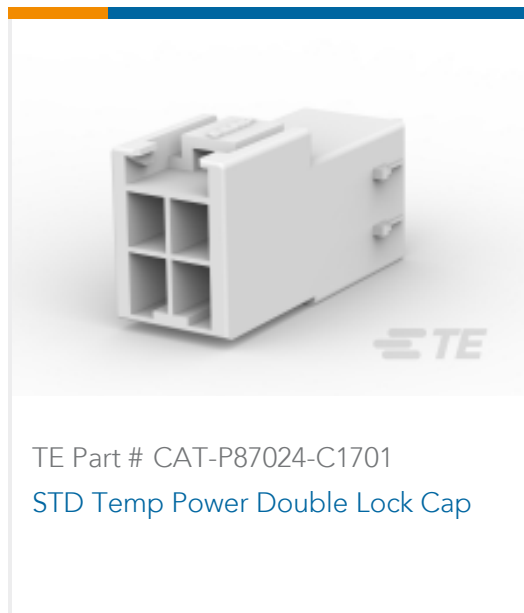
TE Part # CAT-P87024-C1701 STD Temp Power Double Lock Cap