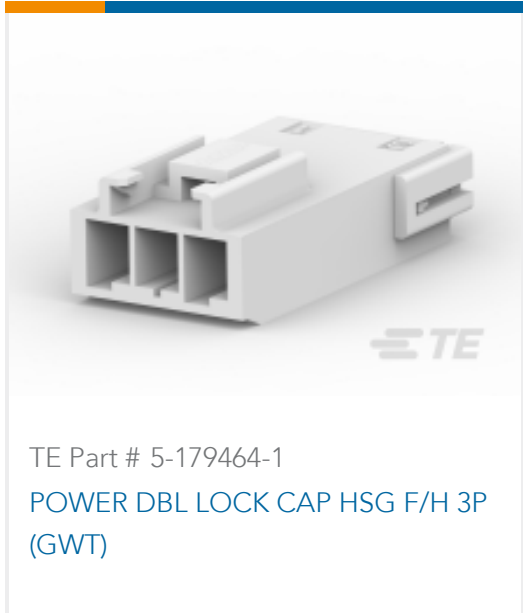
TE Part # 5-179464-1 POWER DBL LOCK CAP HSG F/H 3P (GWT)