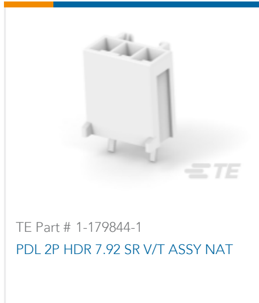
TE Part # 1-179844-1 PDL 2P HDR 7.92 SR V/T ASSY NAT