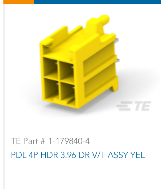
TE Part # 1-179840-4 PDL 4P HDR 3.96 DR V/T ASSY YEL