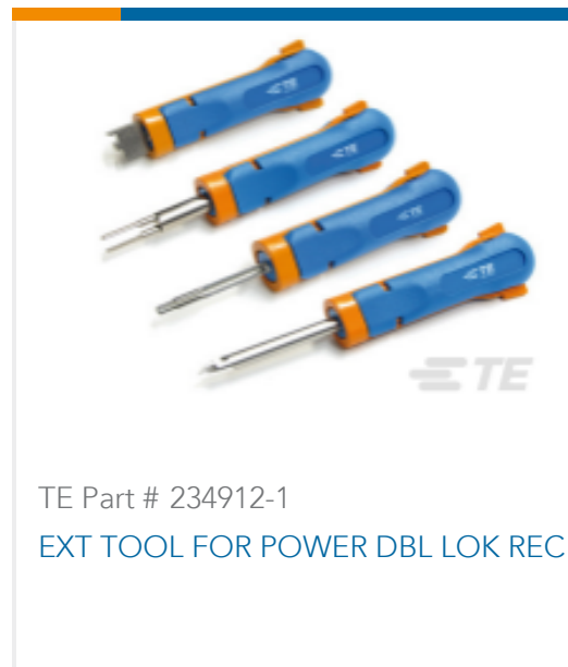
TE Part # 234912-1 EXT TOOL FOR POWER DBL LOK REC