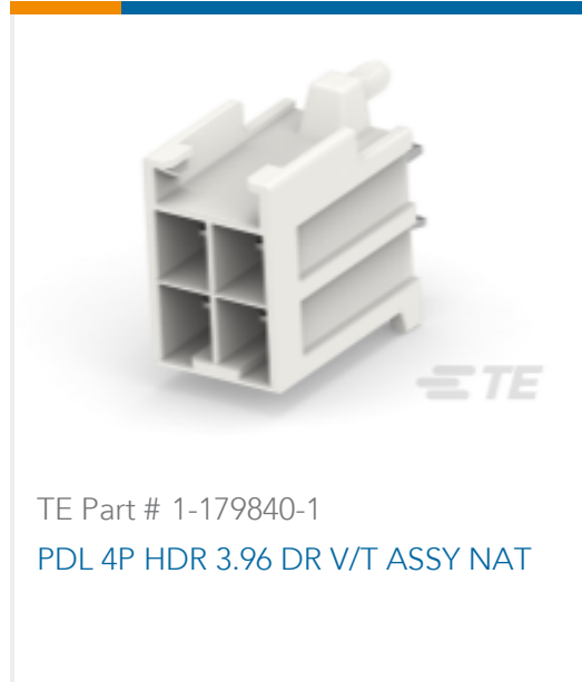
TE Part # 1-179840-1 PDL 4P HDR 3.96 DR V/T ASSY NAT