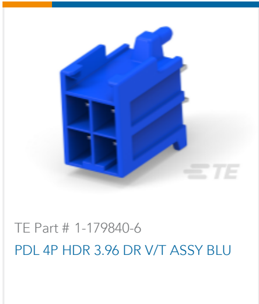
TE Part # 1-179840-6 PDL 4P HDR 3.96 DR V/T ASSY BLU