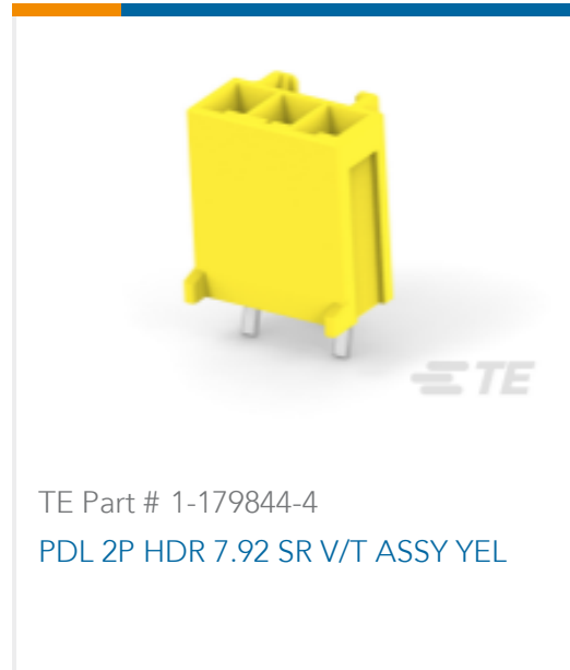
TE Part # 1-179844-4 PDL 2P HDR 7.92 SR V/T ASSY YEL