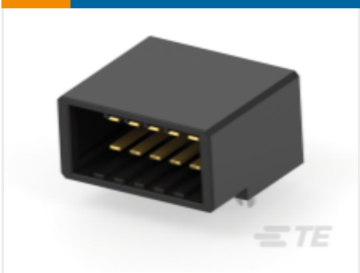
TE Part #1903601-2 Header Assembly: Wire-to-Board, 15A, gold or tin plated