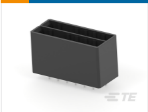
TE Part #1-917337-2 Header Assembly: Wire-to-Board, 15A, gold or tin plated