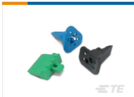
TE Part #W2S DEUTSCH DT WEDGELOCKS