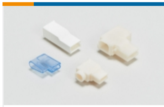
Crimp Terminal Housings(143)