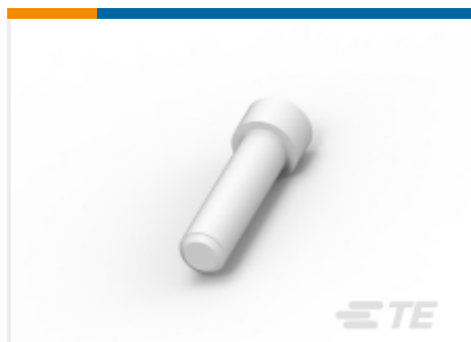
TE Part #114017-ZZ SEALING PLUG, SIZE 12/16, WHT