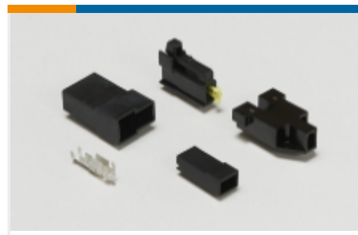
Magnet Wire Terminals(1)