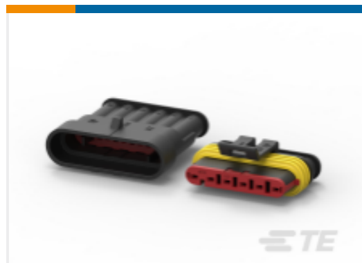
TE Part #282104-1 AMP SUPERSEAL 1.5MM, CONNECTOR HOUSING