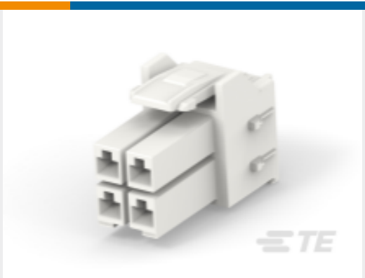
TE Part # 2301329-1 PDL 4P PLUG 3.96MM,DR (GWT)