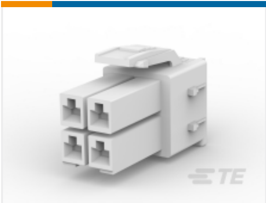
TE Part # CAT-P87024-P729 STD Temp Power Double Lock Plug

This information is provided based on reasonable inquiry of our suppliers and represents our current actual knowledge based on the information they provided. This information is subject to change. The part numbers that TE has identified as EU RoHS compliant have a maximum concentration of 0.1% by weight in homogenous materials for lead, hexavalent chromium, mercury, PBB, PBDE, DBP, BBP, DEHP, DIBP, and 0.01% for cadmium, or qualify for an exemption to these limits as defined in the Annexes of Directive 2011/65/EU (RoHS2). Finished electrical and electronic equipment products will be CE marked as required by Directive 2011/65/EU. Components may not be CE marked. Additionally, the part numbers that TE has identified as EU ELV compliant have a maximum concentration of 0.1% by weight in homogenous materials for lead, hexavalent chromium, and mercury, and 0.01% for cadmium, or qualify for an exemption to these limits as defined in the Annexes of Directive 2000/53/EC (ELV). Regarding the REACH Regulation, the information TE provides on SVHC in articles for this part number is based on the latest European Chemicals Agency (ECHA) 'Guidance on requirements for substances in articles' posted at this URL: https://echa.europa.eu/guidance-documents/guidance-on-reach