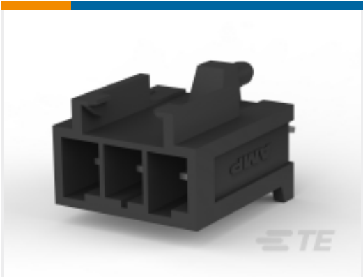
TE Part # 179839-9 AMP POWER D/LOCK T/HDR ASSY 3P