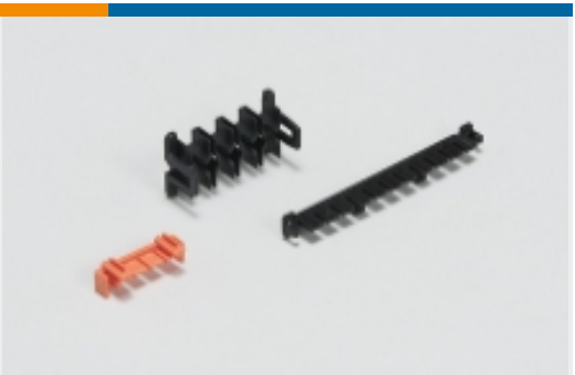
Rectangular Connector Locking(14)