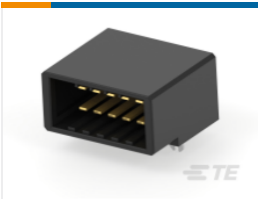
TE Part #1903601-2 Header Assembly: Wire-to-Board, 15A, gold or tin plated