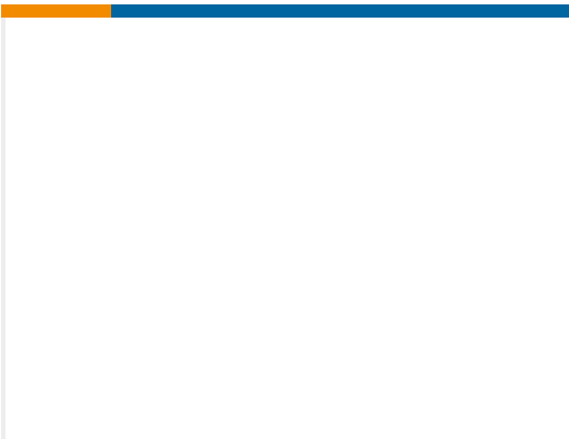
TE Part #171363-1 MULTI INTERLOCK CONN HSG