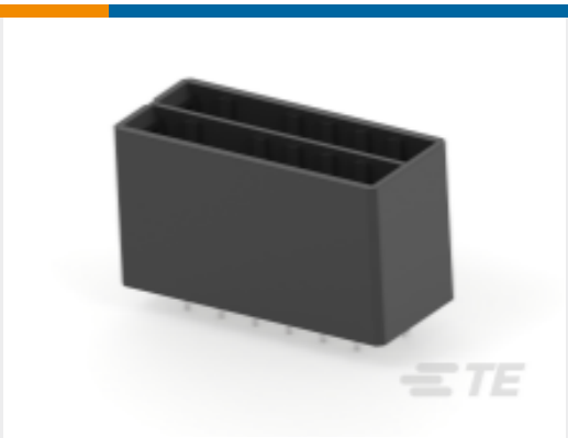
TE Part #2-917337-2 Header Assembly: Wire-to-Board, 15A, gold or tin plated