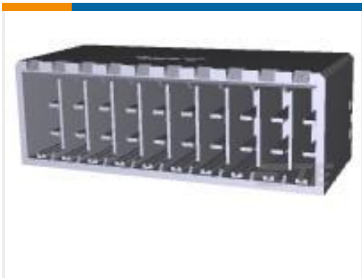
TE Part #316517-2 DYNAMIC 3500 HDR ASSY 20P V