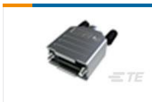
TE Part #1-2198617-5 Ni Plated Plastic Backshell, 15 Way, Str