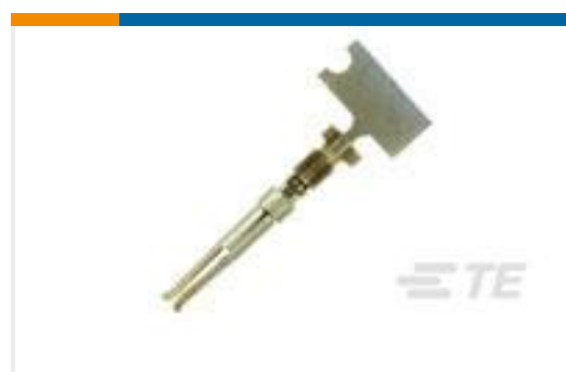
TE Part #66505-4 HD 20 DF SOCKET PLTD