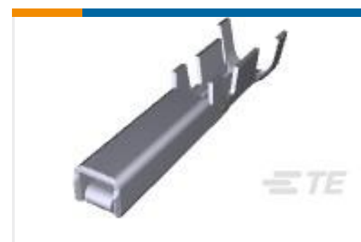
TE Part #1-353717-2 DYNAMIC D-3 REC CONT. 3L AU 0.38 L/P