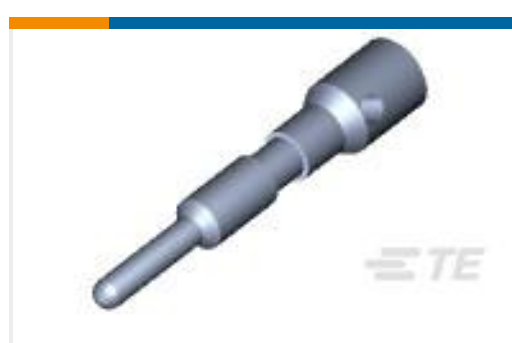
TE Part #193796-1 PIN CONTACT - 2MM,10AWG