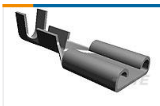
TE Part #63477-1 187 FASTON REC 20-16 AWG BR