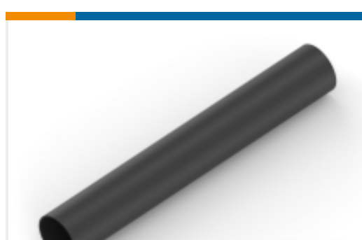
TE Part #EM7500-000 X4-1.0-0-SP-SM