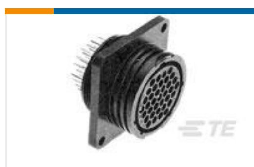
TE Part #1-213825-7 CPC POSTED RECEPTACLE ASSY