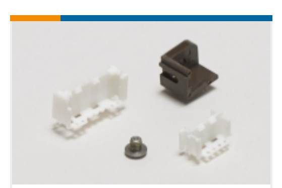
PCB Connector Mounting(8)