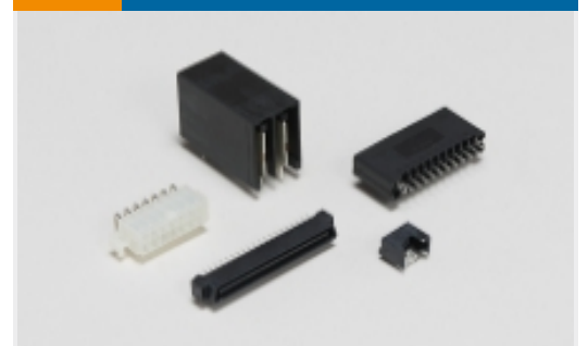
Standard Rectangular Connectors(2)