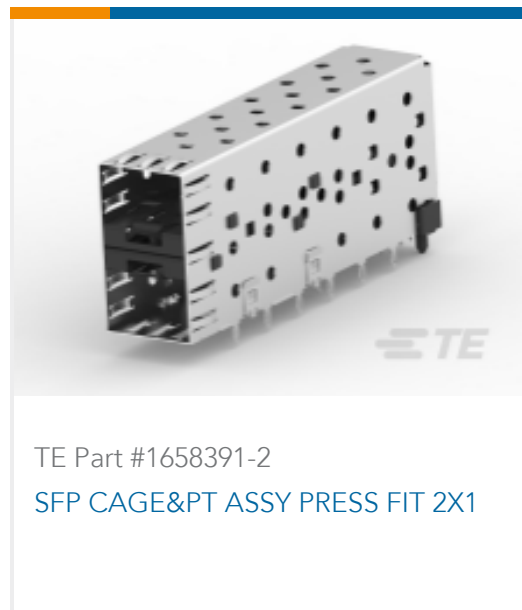
TE Part #1658391-2 SFP CAGE&PT ASSY PRESS FIT 2X1