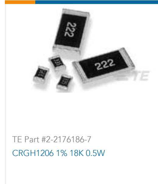
TE Part #2-2176186-7 CRGH1206 1% 18K 0.5W