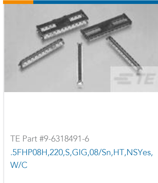
TE Part #9-6318491-6 .5FHP08H,220,S,GIG,08/Sn,HT,NSYes, W/C