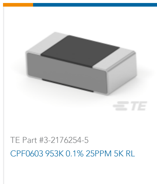
TE Part #3-2176254-5 CPF0603 953K 0.1% 25PPM 5K RL