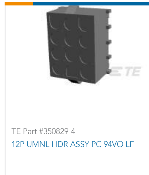
TE Part #350829-4 12P UMNL HDR ASSY PC 94VO LF