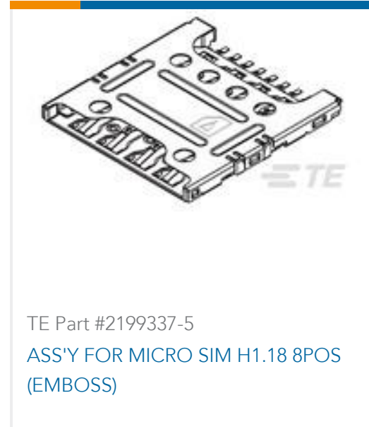
TE Part #2199337-5 ASS'Y FOR MICRO SIM H1.18 8POS (EMBOSS)