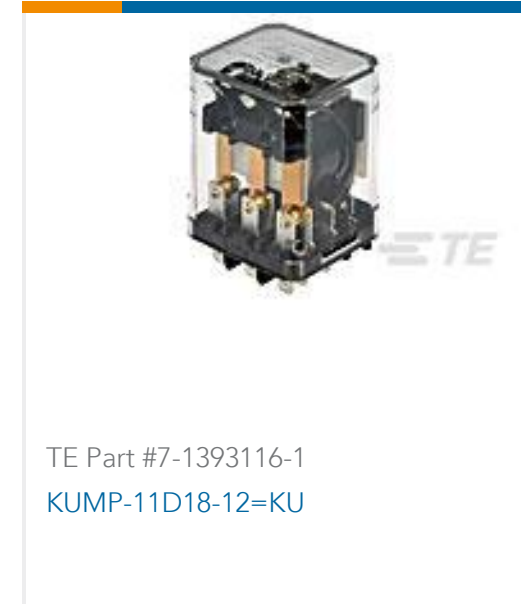
TE Part #7-1393116-1 KUMP-11D18-12=KU