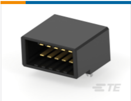
TE Part #1903601-2 Header Assembly: Wire-to-Board, 15A, gold or tin plated