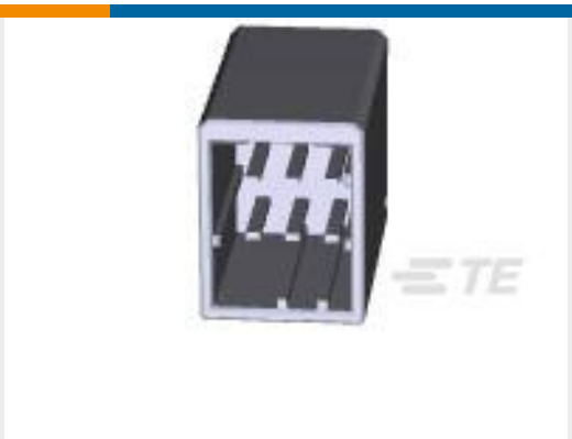
TE Part #1318124-1 DYNAMIC D2100 HDR V ASSY 6P