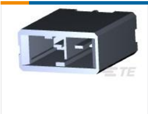
TE Part #1-917337-2 DYNAMIC D-3 VERTI. HDR ASSY 2P