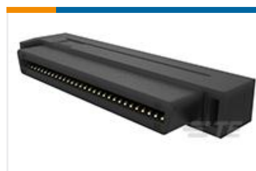
TE Part #1734098-5 Champ050 50p A/P RCPT 25CL PB