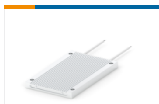
TE Part #2176247-1 TJT 150W 1R0 5%