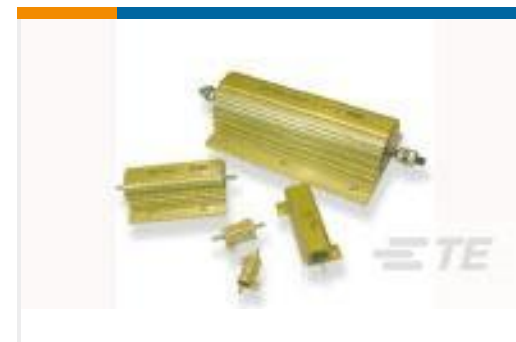
TE Part #8-1625999-1 HSC100 5R6 5%