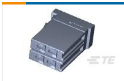
TE Part #175363-2 DYNAMIC D-3500 REC HSG 4P