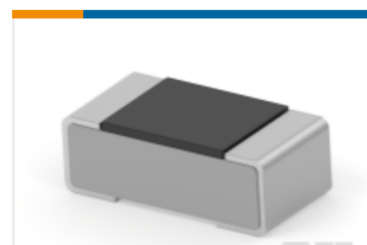
TE Part #2-2176338-7 CRGCO 0402 22K 5%