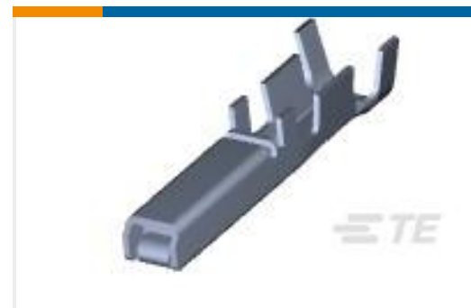
TE Part #1-353715-5 DYNAMIC D-3 REC CONT. 3L PRE-TIN