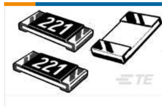
TE Part #2-2176231-1 3522 68R 1% 3W