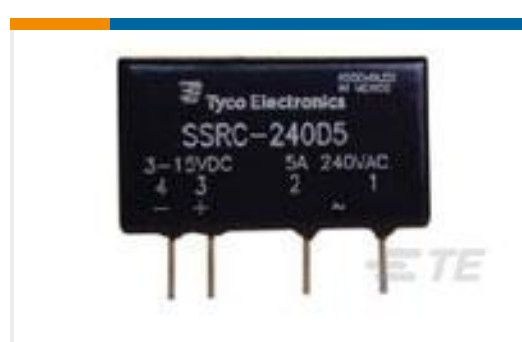
TE Part #5-1393030-8 SSRC SRS,THT,5A,240V AC -DC I/P