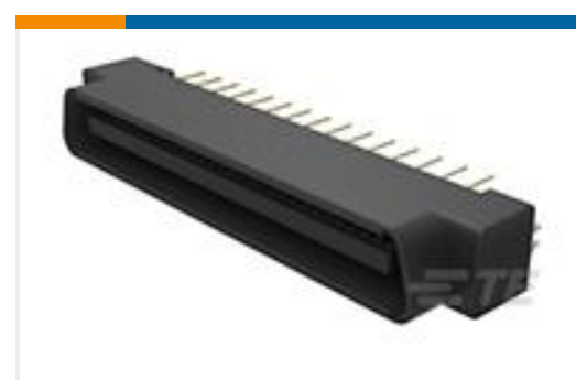
TE Part #1734100-5 Champ050 series,50pos,Au over PdNi