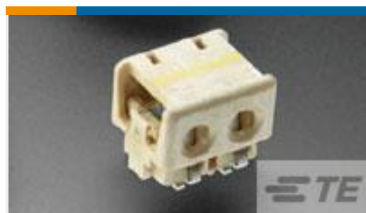
TE Part #2106431-3 Connector, SMT-IDC PASS THRU, 3 POS, 18