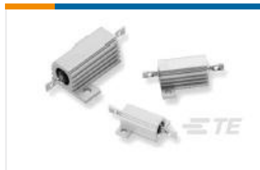
TE Part #1879074-9 THS15 2R0 5%