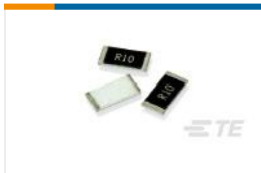
TE Part #2176053-9 RLP73N 2A R11 1% 1K RL