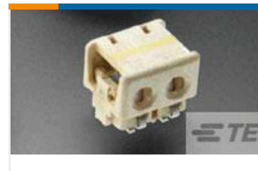
TE Part #2106431-1 Connector, SMT-IDC PASS THRU, 1 POS, 18