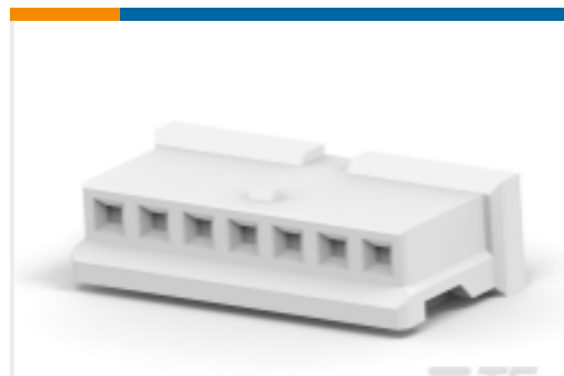
TE Part #1775441-7 AMP HPI 1.5MM RECEPTACLE HOUSINGS