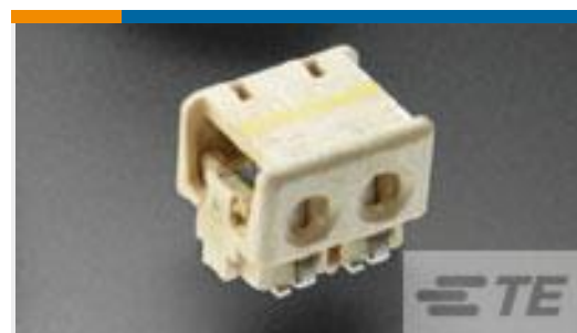
TE Part #2-2106431-3 Connector, SMT-IDC PASS THRU, 3 POS, 22