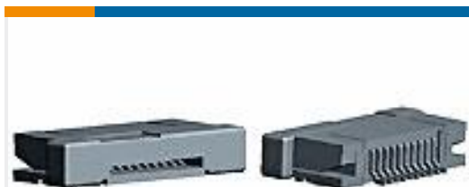
TE Part #2-1734592-9 FPC CONN. 0.5MM PITCH B/C, 29P