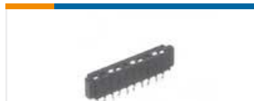
TE Part #5-520315-3 TRIOMATE ASSY V 3P L=3.556LDFR