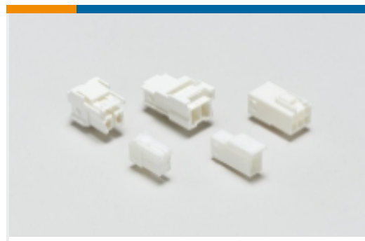
Rectangular Power Connectors(13)