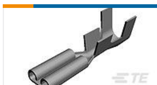
TE Part #160625-2 110 FASTON, REC., 20-17 AWG, TPBR