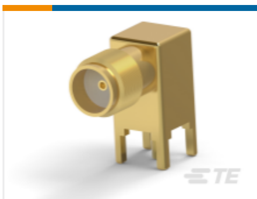
TE Part #5-1814400-2 SMA R/A PCB Skt GZD