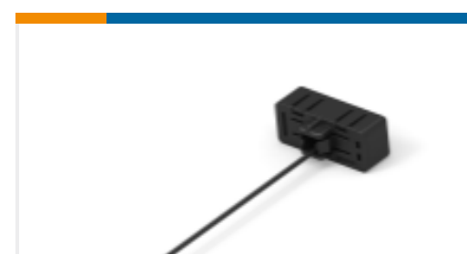
TE Part #1-1513472-8 UAM ASSEMBLY 210 MM CABLE BLACK