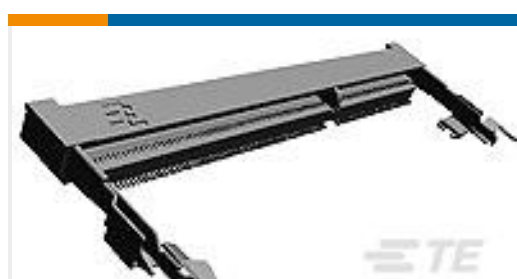
TE Part #2-2013297-1 EMBOSS TAPE DDR3 204P 8H STD