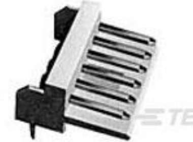
TE Part #1-171826-0 EI.SRS.POST HDR.ASS