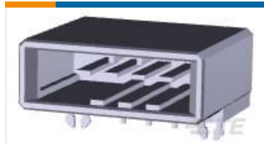
TE Part #1-178294-2 DYNAMIC D3100 HDR ASY 4P H K/X