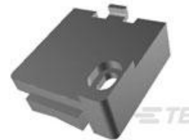
TE Part #640717-1 12P UMNL STR/REL