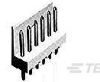
TE Part #1-171825-2 POST HDR ASSY VERT AMP EI CONN