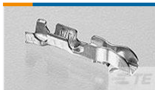
TE Part #170205-1 E.I. SERIES CONTACT LP