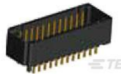
TE Part #1-292252-6 CT DOUBLE ROW ASSY V 16P HDR N