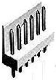
TE Part #173081-4 4P EIS POST HDR ASSY