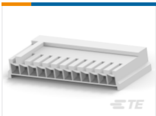
TE Part # 1-171822-2 EIS REC. HSG 12P-NATURAL