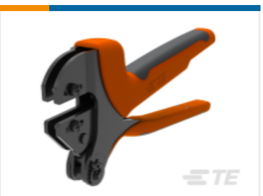
TE Part # 9-1478240-0 SDE SA PEW12 HAND TOOL FRAME-NO DIES