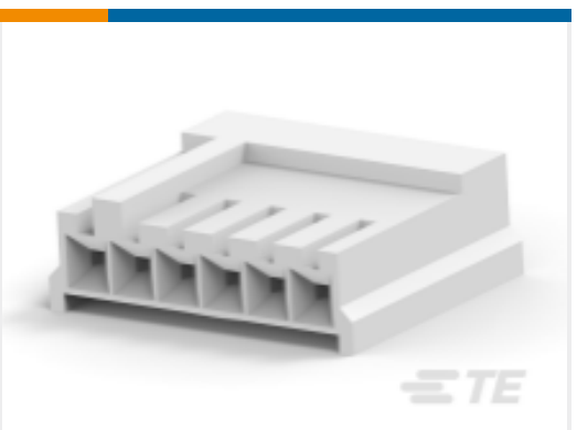
TE Part # 171822-6 EIS REC. HSG 6P-NATURAL