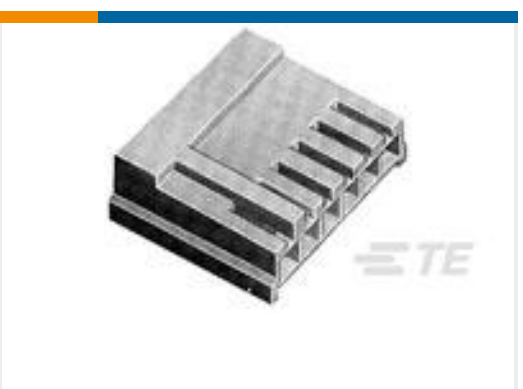
TE Part # 4-171822-8 E.I.SERIES CONN REC 8P