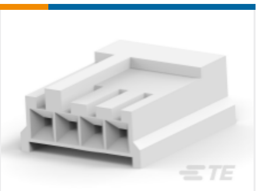
TE Part # 171822-4 EIS REC. HSG 4P-NATURAL