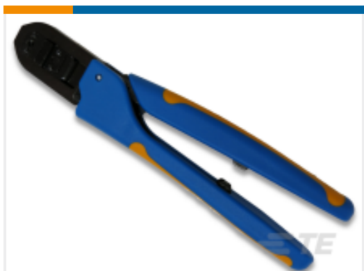
TE Part # 91556-1 CCII AMP EI SERIES 26-20 ASSY