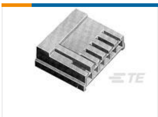
TE Part # 4-171822-4 EIS REC. HSG 4P-BLUE