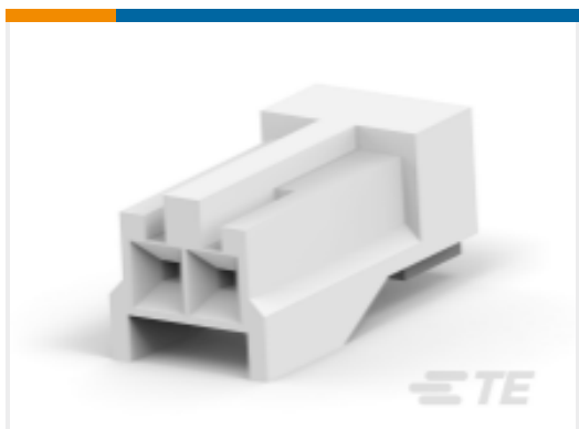
TE Part # 171822-2 EIS REC. HSG 2P-NATURAL