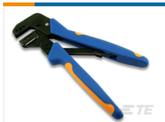
TE Part # 354940-1 PRO-CRIMPER III FRAME W/O DIES