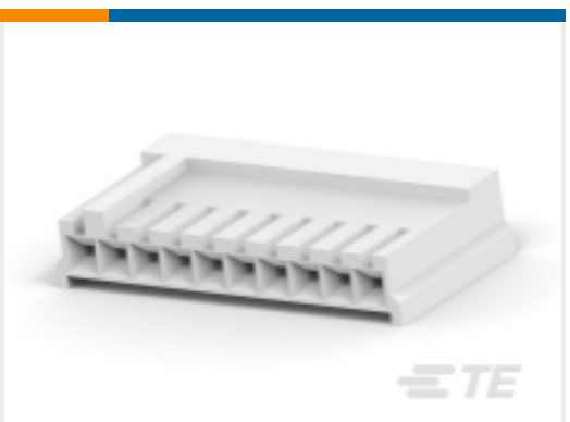
TE Part # 1-171822-0 EIS REC. HSG 10P-NATURAL