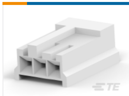
TE Part # 171822-3 EIS REC. HSG 3P-NATURAL