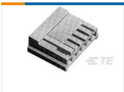
TE Part # 2-171822-3 EIS REC. HSG 3P-BLACK