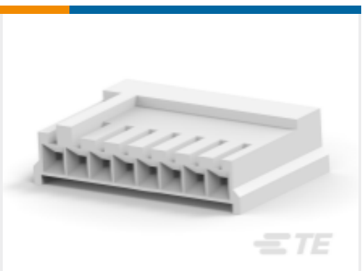
TE Part # 171822-8 EIS REC. HSG 8P-NATURAL