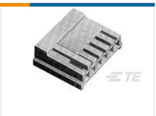
TE Part # 2-171822-4 EIS REC. HSG 4P-BLACK