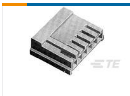
TE Part # 4-171822-5 EIS REC. HSG 5P-BLUE