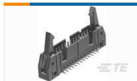
TE Part #5499786-4 A/L UNIV HDR 20P RA LG LAT