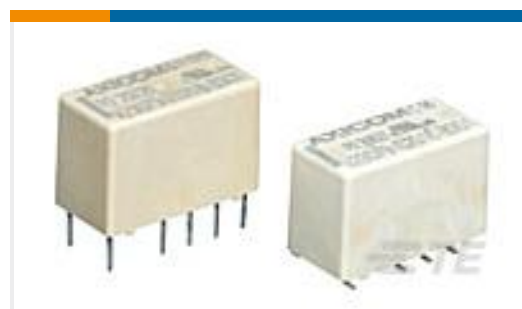
TE Part #5-1393789-1 V23079G2003B301