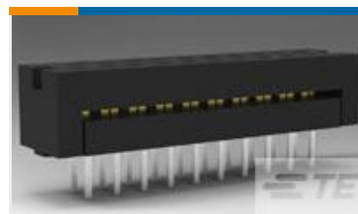
TE Part #1-746610-5 20 DIP PLUG, 100CL, LEAD FREE