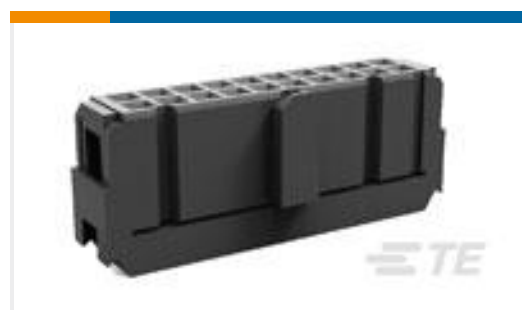
TE Part #1658621-4 20 NOVO MIL/CTR 15DP, LEAD FREE