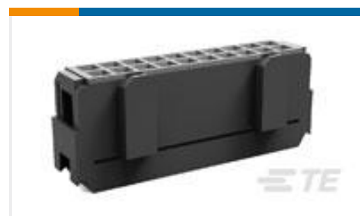
TE Part #1658624-4 20 NOVO DUAL 30DP, LEAD FREE