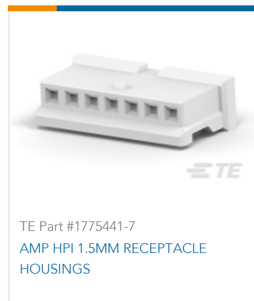
TE Part #1775441-7 AMP HPI 1.5MM RECEPTACLE HOUSINGS