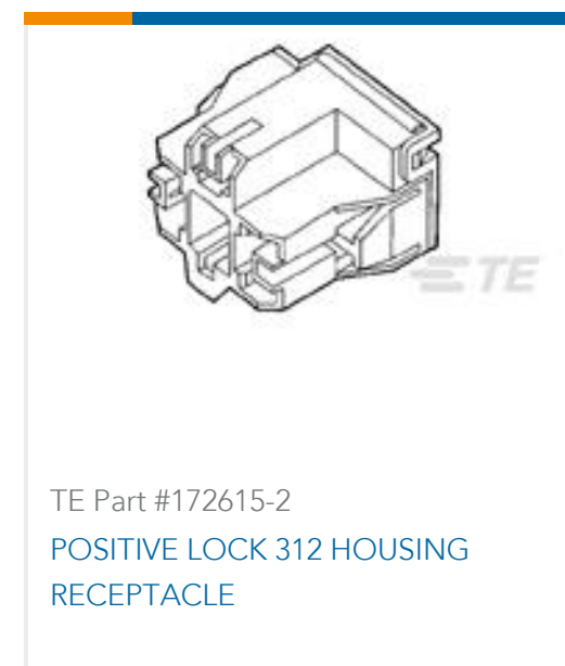
TE Part #172615-2 POSITIVE LOCK 312 HOUSING RECEPTACLE