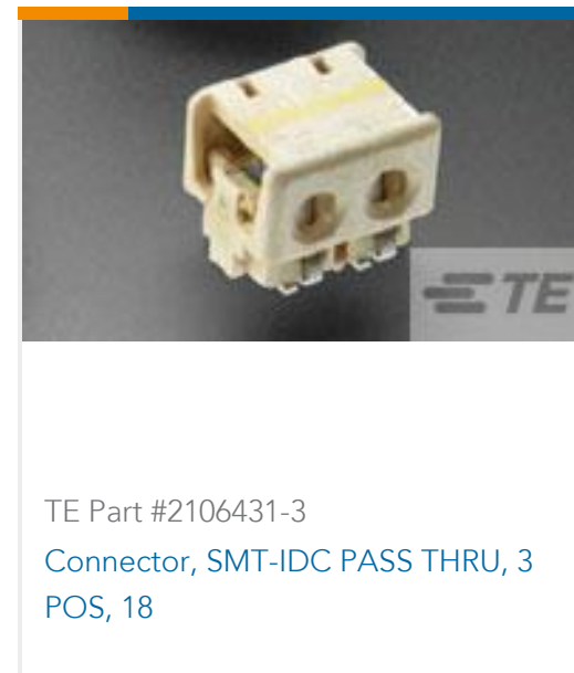
TE Part #2106431-3 Connector, SMT-IDC PASS THRU, 3 POS, 18