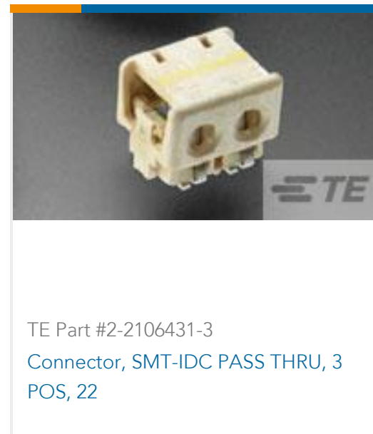
TE Part #2-2106431-3 Connector, SMT-IDC PASS THRU, 3 POS, 22