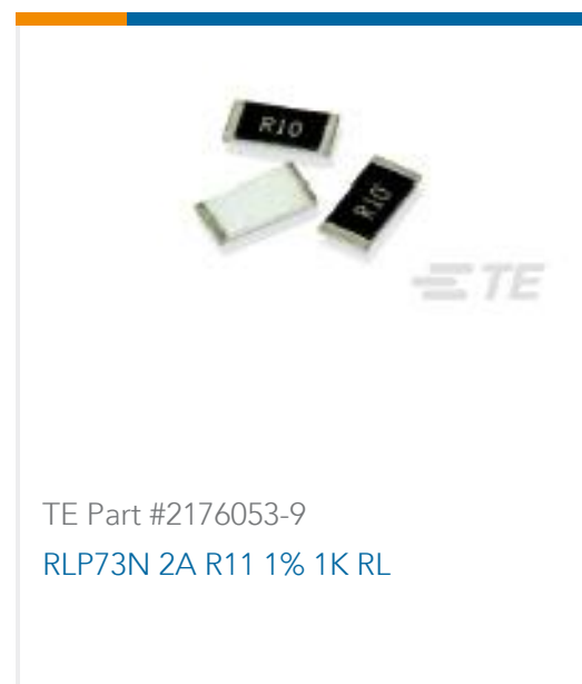
TE Part #2176053-9 RLP73N 2A R11 1% 1K RL