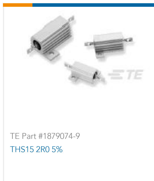
TE Part #1879074-9 THS15 2R0 5%