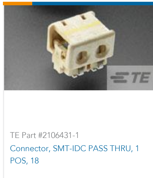
TE Part #2106431-1 Connector, SMT-IDC PASS THRU, 1 POS, 18