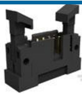
TE Part # 1-111492-9 024 UNIV I/O 30DP NO EARS LTCH