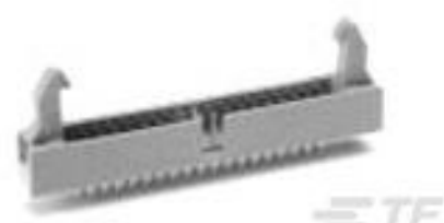
TE Part # 1761686-8 IDC LOW PRO HDR 24P VERT LG LAT