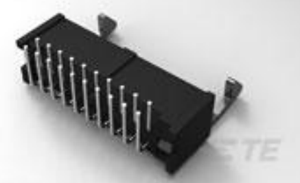
TE Part # 1761688-8 IDC LOW PRO HDR 24P VERT LG LAT