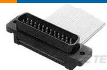
TE Part # 1658615-3 15 POS HDF PLUG, AP, LEAD FREE