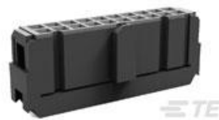
TE Part # 1658621-6 26 NOVO MIL/CTR 15DP, LEAD FREE