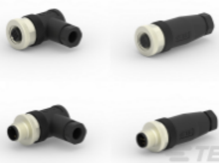
TE Part # T4111002051-000 M12 Field Installable Unshielded