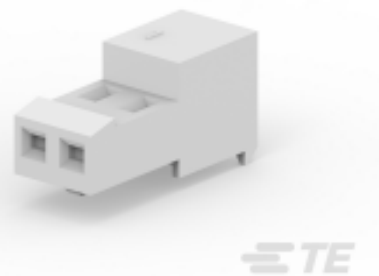
TE Part # 3-640440-6 Nylon Tin Plated Receptacle: 2.54mm, No Mating Alignment, MTA 100