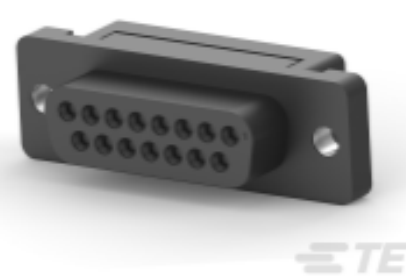
TE Part # 1658610-2 IDC D-Sub: Receptacle Assembly, Low Profile, Signal, 2.77 mm