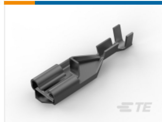
TE Part # 170327-1 250 PL MKII REC. 22-18AWG PTBR