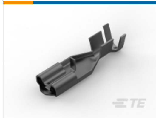
TE Part # 170329-1 250 PL MKII REC. 15-10AWG PTBR