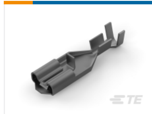
TE Part # 170328-1 250 PL MKII REC. 18-14AWG PTBR