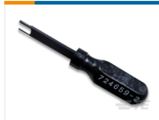
TE Part # 724659-2 EXT TOOL FOR POSITIVE .250