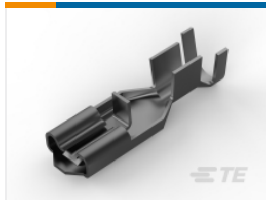
TE Part # 63239-1 POSITIVE LOCK 250 REC 12-10 AWG TPBR