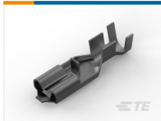
TE Part # 170335-1 PL 250 RECEPTACLE 15-10 AWG PTPBR