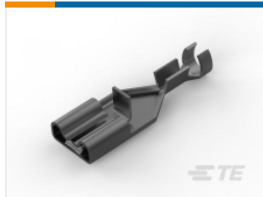
TE Part # 170333-1 PL 250 RECEPTACLE 22-18 AWG PTPBR