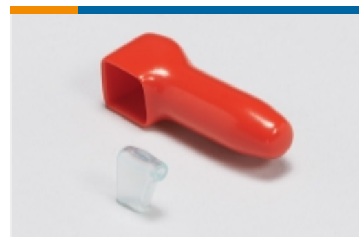
Insulation Boots & Sleeves(4)