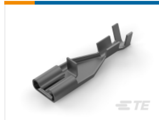
TE Part # 170334-1 205 PL MII,REC.,18-14,PTBR