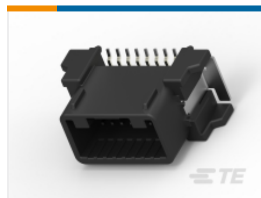
TE Part #1717396-3 0.64 SMD 16P CAP ASSEMBLY V-TYPE Tray