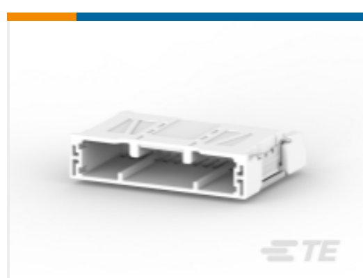
TE Part #1939082-9 0.5/1.5 HYBRID 16POS SMT CAP ASSY