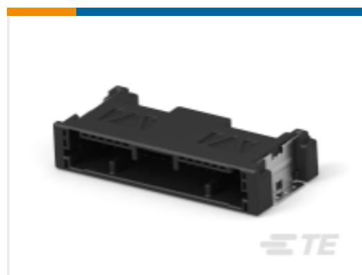
TE Part #2013029-5 0.50 SERIES 24POS CAP ASSY(SMT TYPE)