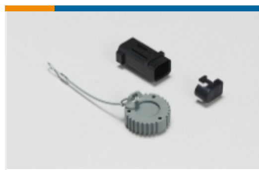
Automotive Connector Caps &amp; Covers (6)