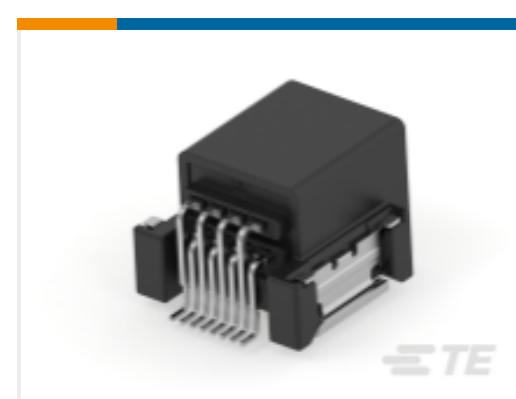
TE Part #2237149-2 8POS,TAB0.64X0.64,HDR ASSY, 90DEG,SMD