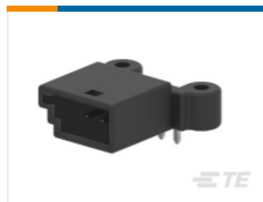
TE Part #1-1565749-0 SIGNAL HEADER