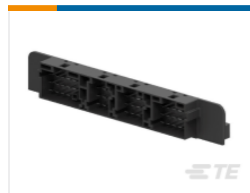
TE Part #1554287-2 HIGH PIN COUNT HEADER