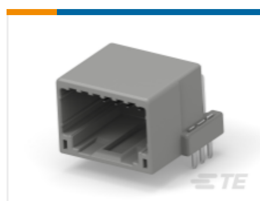
TE Part #2297730-1 0.64 12POS CAP ASSY SMT REVERSE LOCK