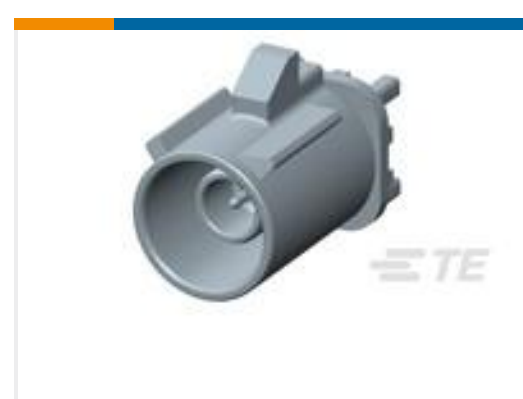
TE Part #5-2203452-1 MALE ASM, 1 POS, VERT, PCB, KEY A