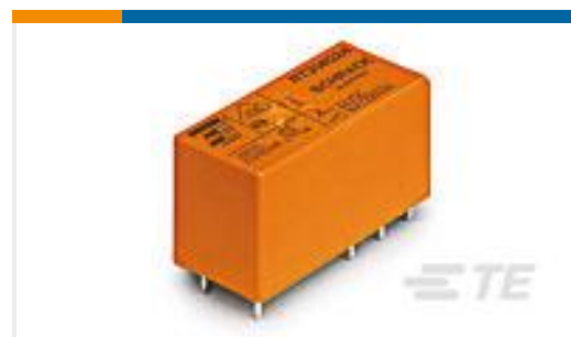
TE Part #1-1649328-3 RT314012