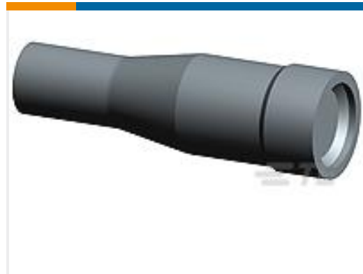
TE Part #293284-1 NECTOR S BUS BAR BOOT