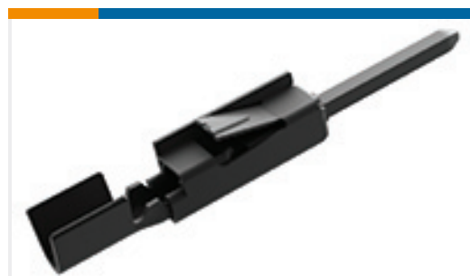
TE Part #1740335-1 MICRO QUADLOK SYSTEM PIN CONTA