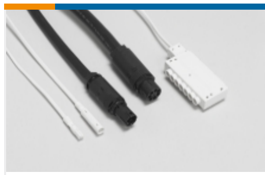
Lighting Cable Assemblies(1)