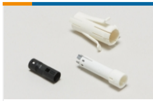
Plug & Socket Lighting Connector Accessories(57)