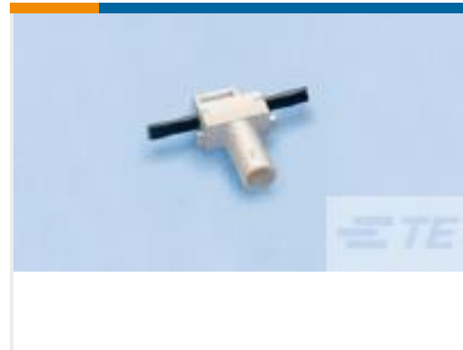
TE Part #293270-7 NECTOR S BUS BAR SEALED CONN LV-2