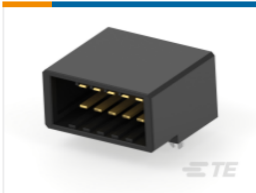
TE Part #178307-5 Header Assembly: Wire-to-Board, 15A, gold or tin plated