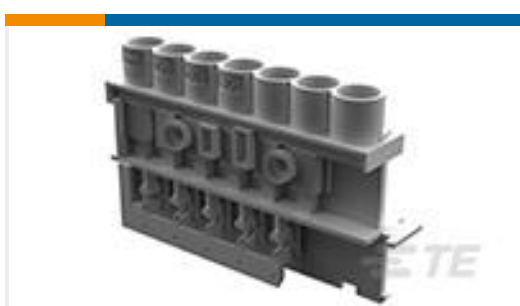
TE Part #1740317-3 NECTOR S DISTRIBUTOR ASSY 6 POS BLACK