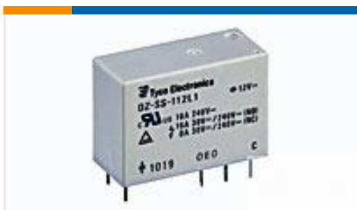
TE Part #1440002-8 OZ-SH-112LM1,294