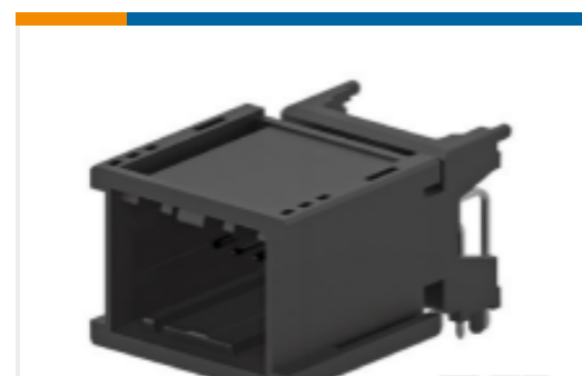
TE Part #2177372-3 MINIATURIZED HEADER