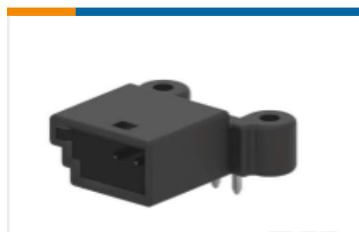
TE Part #1-1355154-1 SIGNAL HEADER