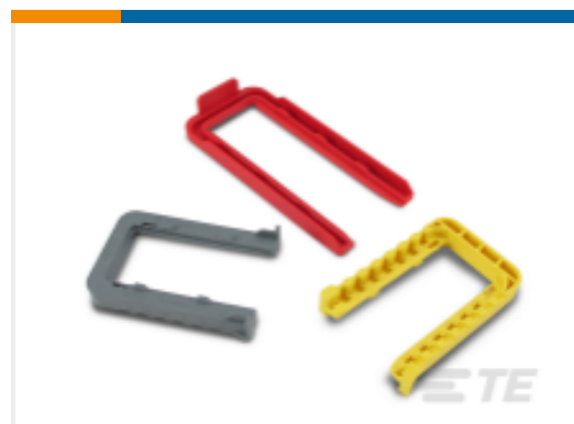
TE Part #2112166-3 LEAVYSEAL LOCKING SLIDES