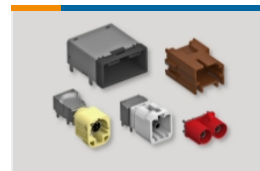
Data Connectivity Headers(2)