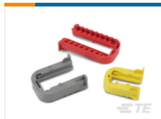
TE Part #1703838-1 Heavy Duty Sealed Connector Series Fixing Slides