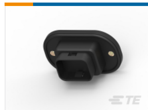
TE Part #1823444-1 ADAPTER, FOR A-PILLAR, ASSY