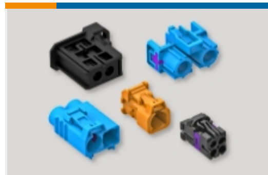
Data Connectivity Housings(18)