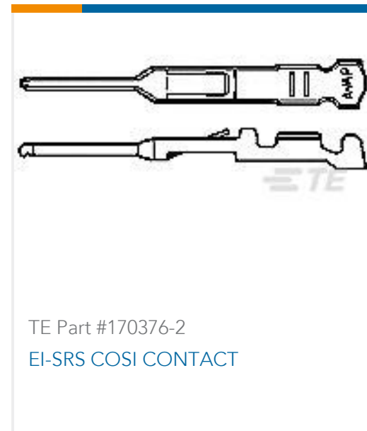
TE Part #170376-2 EI-SRS COSI CONTACT