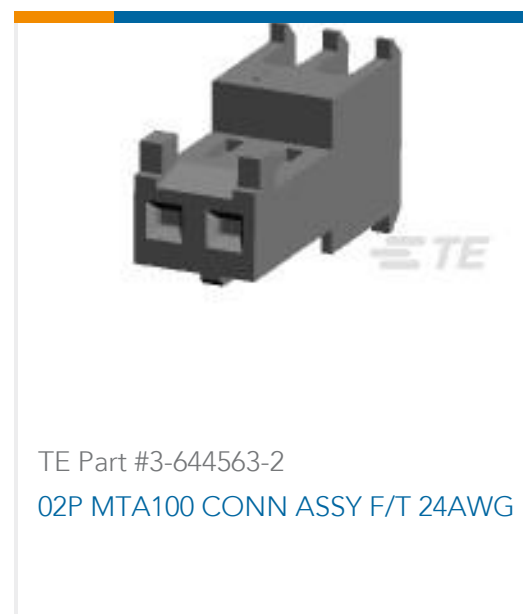
TE Part #3-644563-2 02P MTA100 CONN ASSY F/T 24AWG