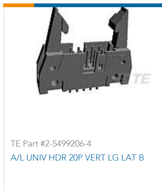
TE Part #2-5499206-4 A/L UNIV HDR 20P VERT LG LAT B