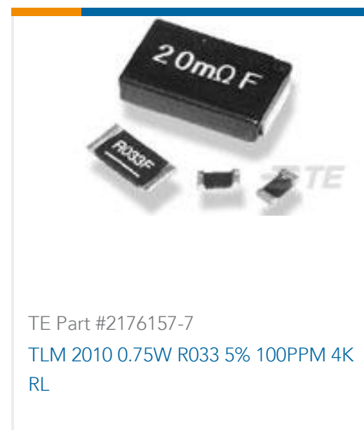
TE Part #2176157-7 TLM 2010 0.75W R033 5% 100PPM 4K RL