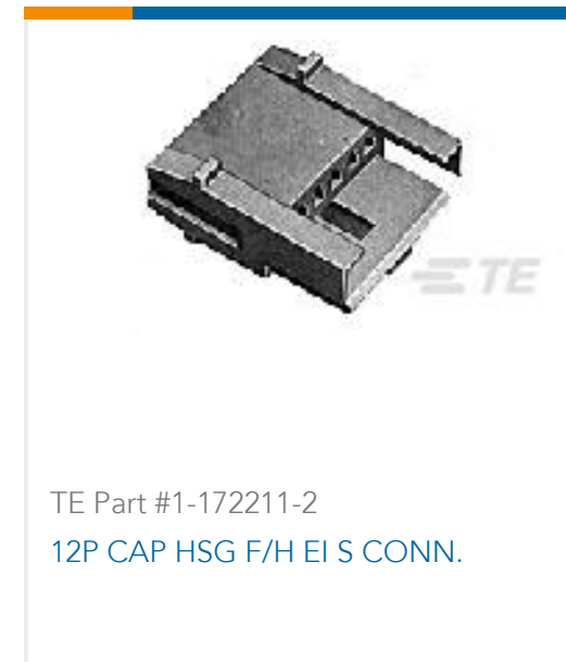
TE Part #1-172211-2 12P CAP HSG F/H EI S CONN.