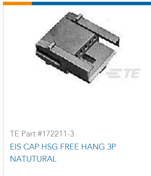
TE Part #172211-3 EIS CAP HSG FREE HANG 3P NATUTURAL