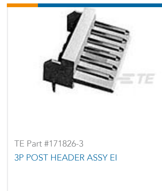
TE Part #171826-3 3P POST HEADER ASSY EI RL