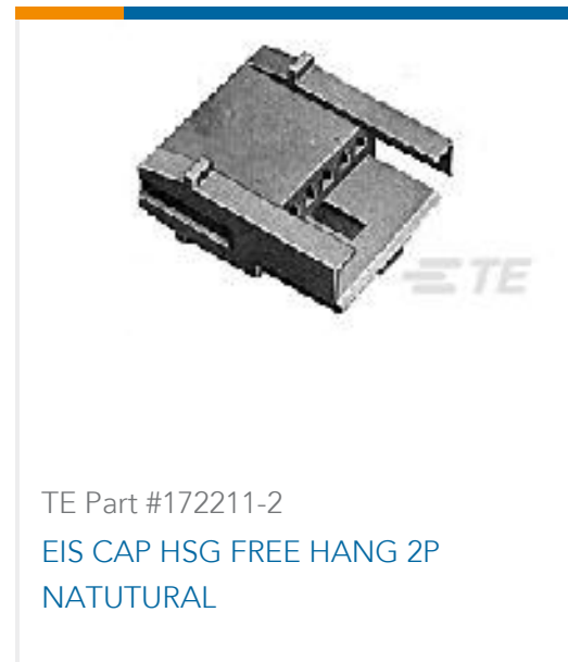
TE Part #172211-2 EIS CAP HSG FREE HANG 2P NATUTURAL