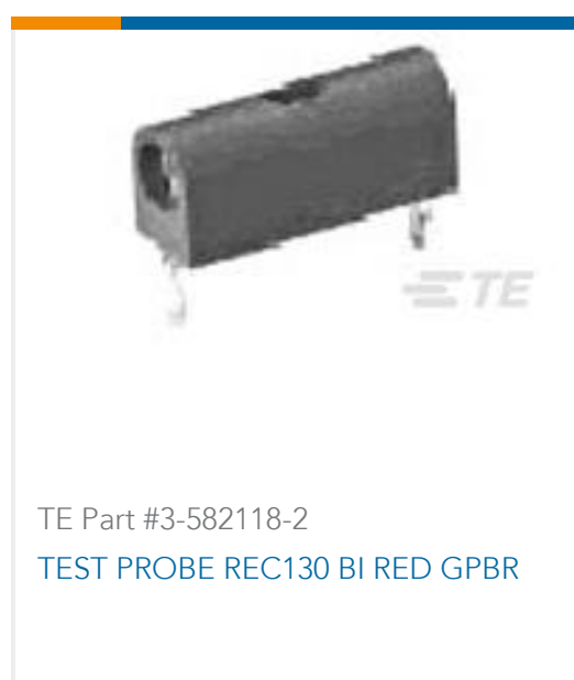
TE Part #3-582118-2 TEST PROBE REC130 BI RED GPBR